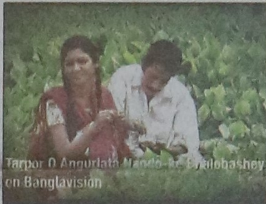
Tarpor O Angurlata Nando-ke Bhalobashey on Banglavisision