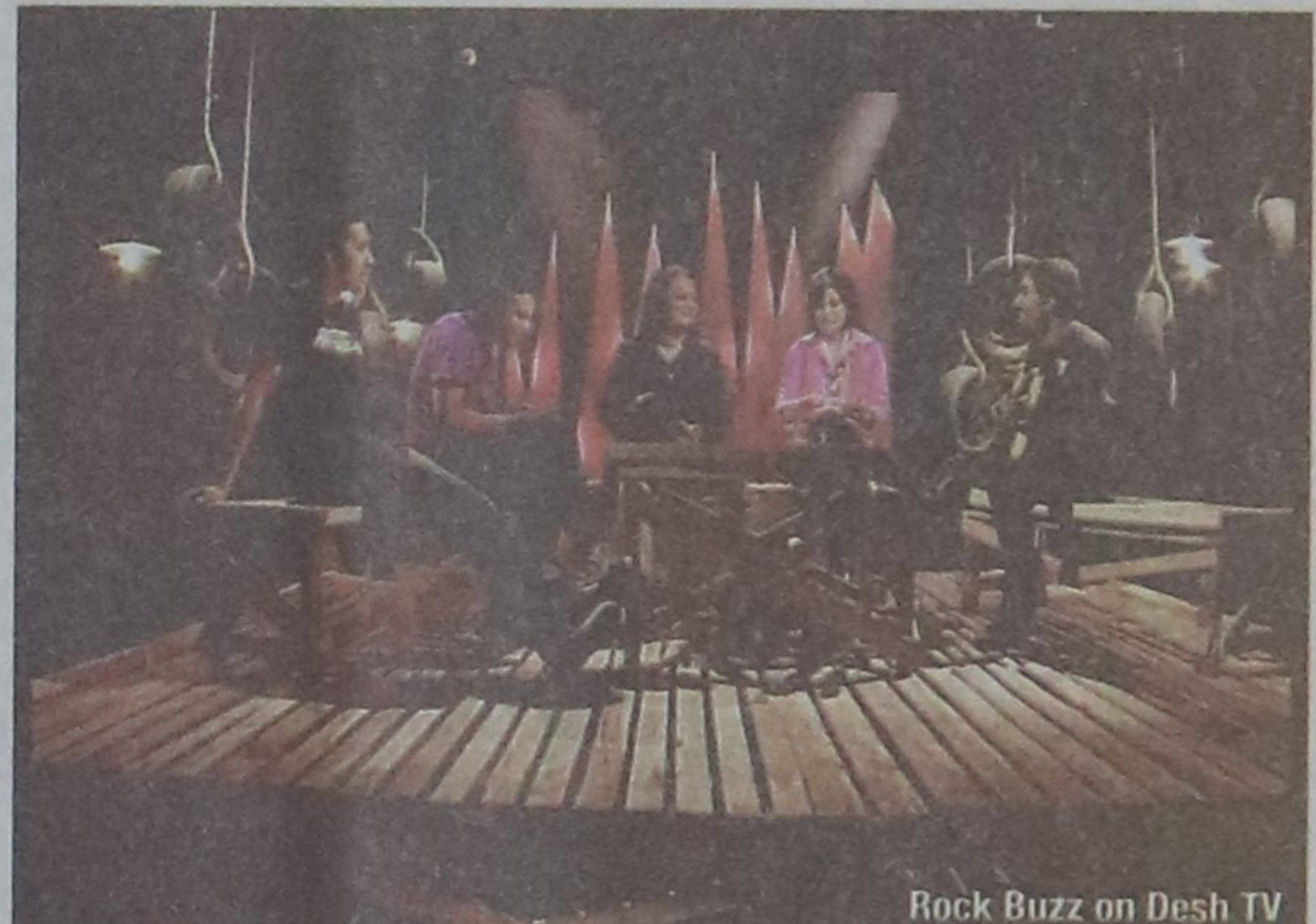
Rock Buzz on Desh TV

Chol on Banglavisision the same day at 9:40 pm. On the second day of Eid, the duo will be featured on Baishakhi. They will be presenting a dance on BTV on the third day of Eid as well.