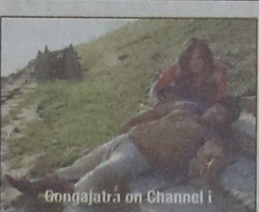
Gongajatra on Channel i

woman and assumes her as his wife. However, he tells them the truth that she is not his wife.