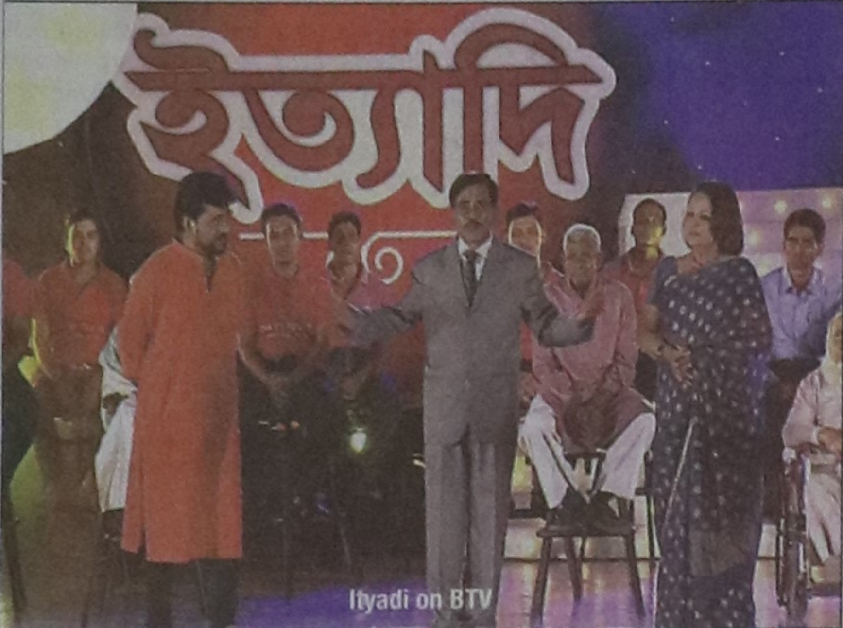
Ityadi on BTV

This Eid-ul-Fitr, TV viewers are in for a treat. BTV, ATN Bangla, Channel i, ntv, Banglavisision, Desh TV and others are offering an array of special TV plays, feature films, tele-films, musical and variety shows on the occasion of Eid. The programmes will be aired throughout the week and will feature noted and popular artistes. Here are the highlights of the Eid-special programmes.