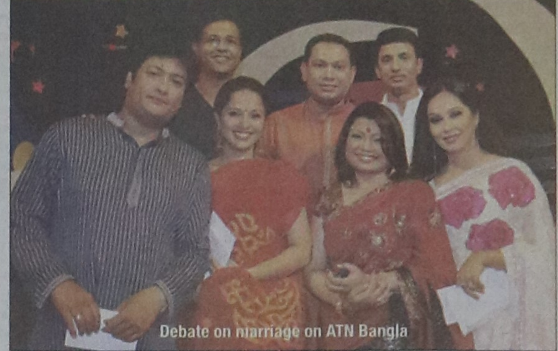
Debate on marriage on ATN Bangla