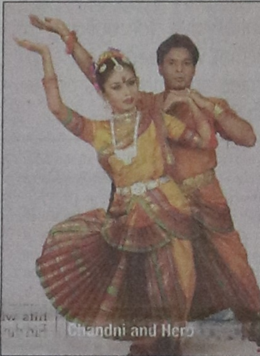
Chandni and Hero

The play circles around Raja Sarker who cheats gullible people from a village in North Bengal, promising to send them to Saudi Arabia. Among those duped are Hasan and Ratan who sell all their land and property in the hope of reaping rich returns. Finding that they have been cheated, all of them return to their village