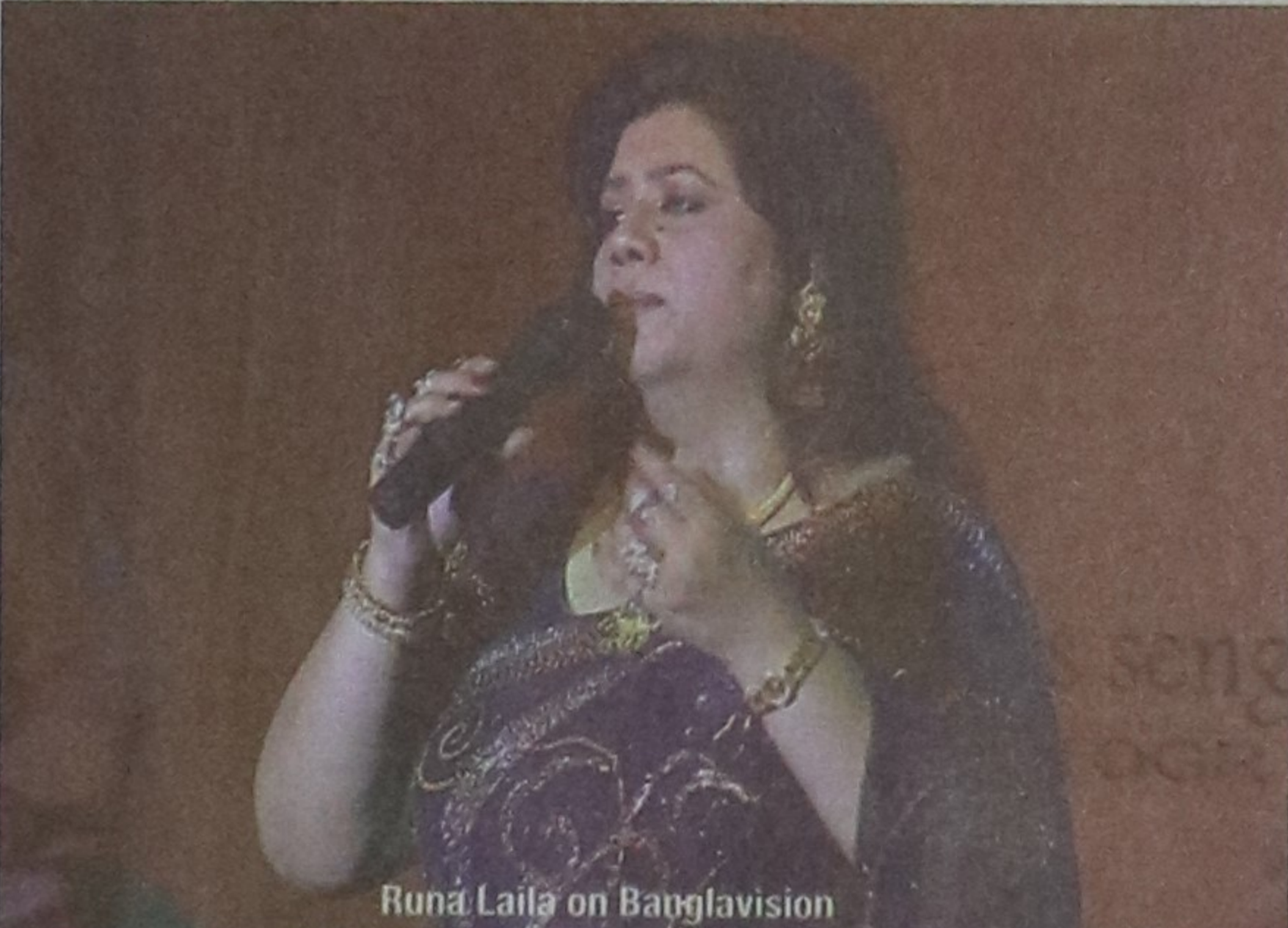
Runa Laila on Banglavisision