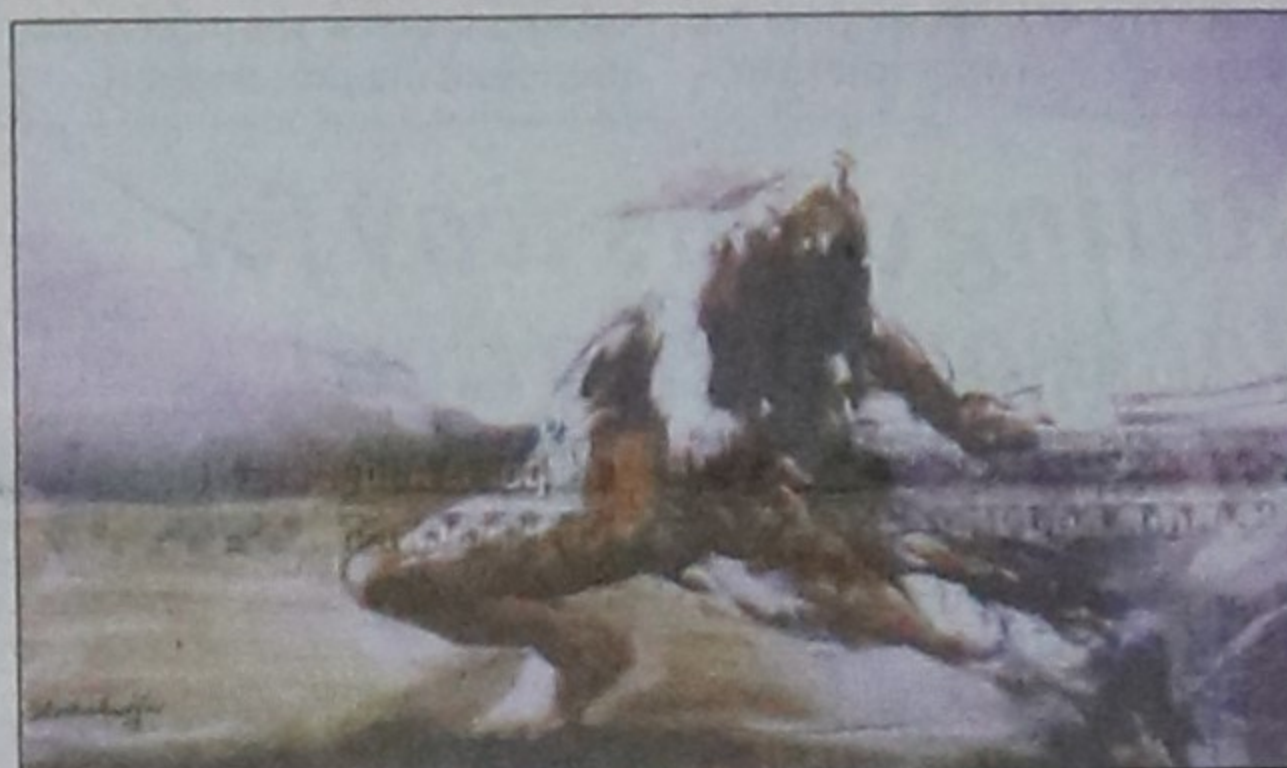
Desire by Shahabuddin Ahmed

The exhibition will continue till October 9.