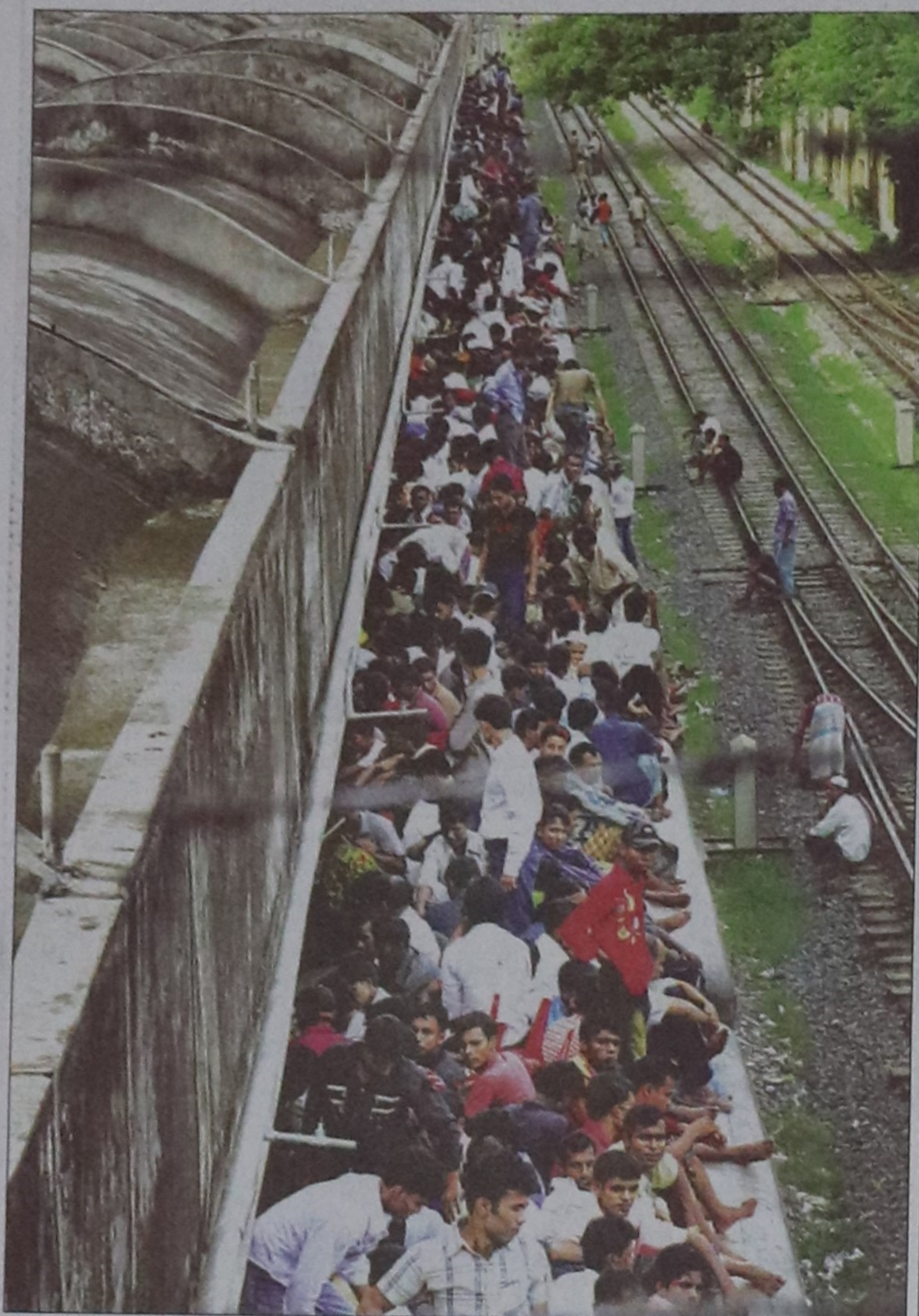
Failing to get any space inside a train, home-bound passengers perch precariously on its roof at Kamalapur Railway Station yesterday as Eid holiday begins today.