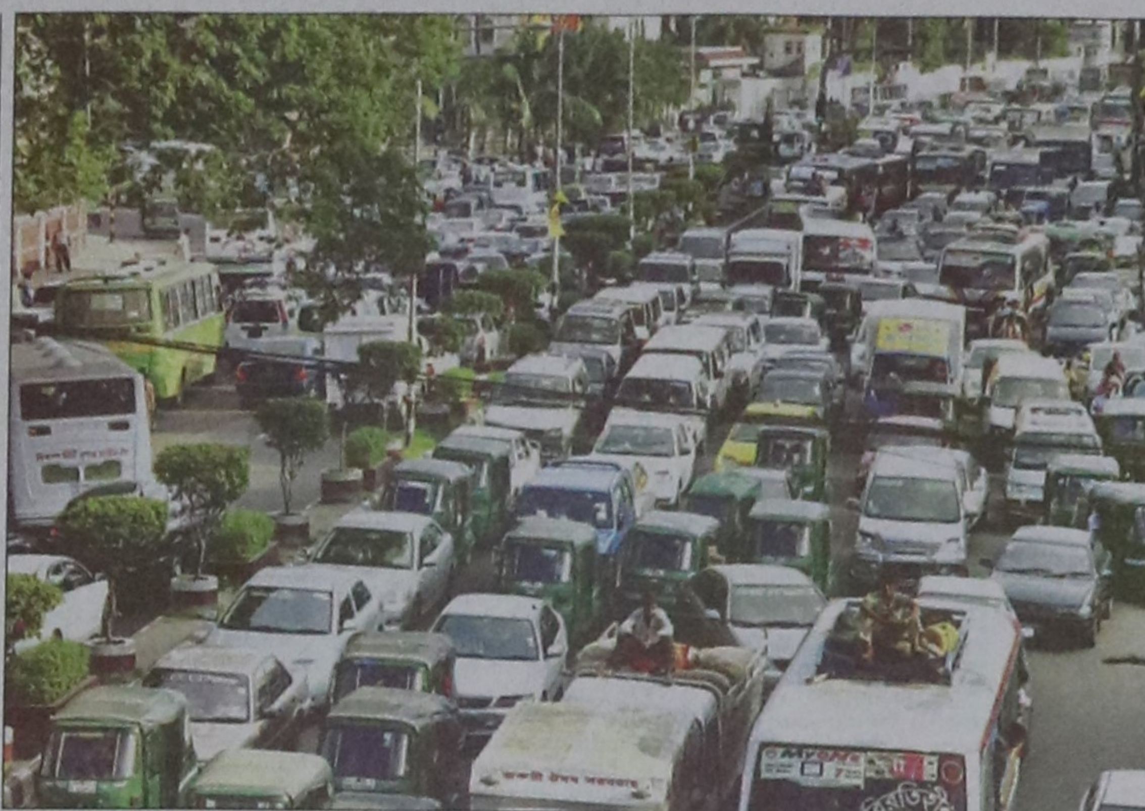
The road between Shahbagh and Hotel Sonargaon in the city experiences phenomenal traffic congestion yesterday like the other days, though millions of people are streaming to their village homes to enjoy the Eid vacation with their near and dear ones.

Meanwhile, retailers sold sugar at between Tk 50 and 54 per kg yesterday. But the price was between Tk 60 and Tk 62 as of Friday.