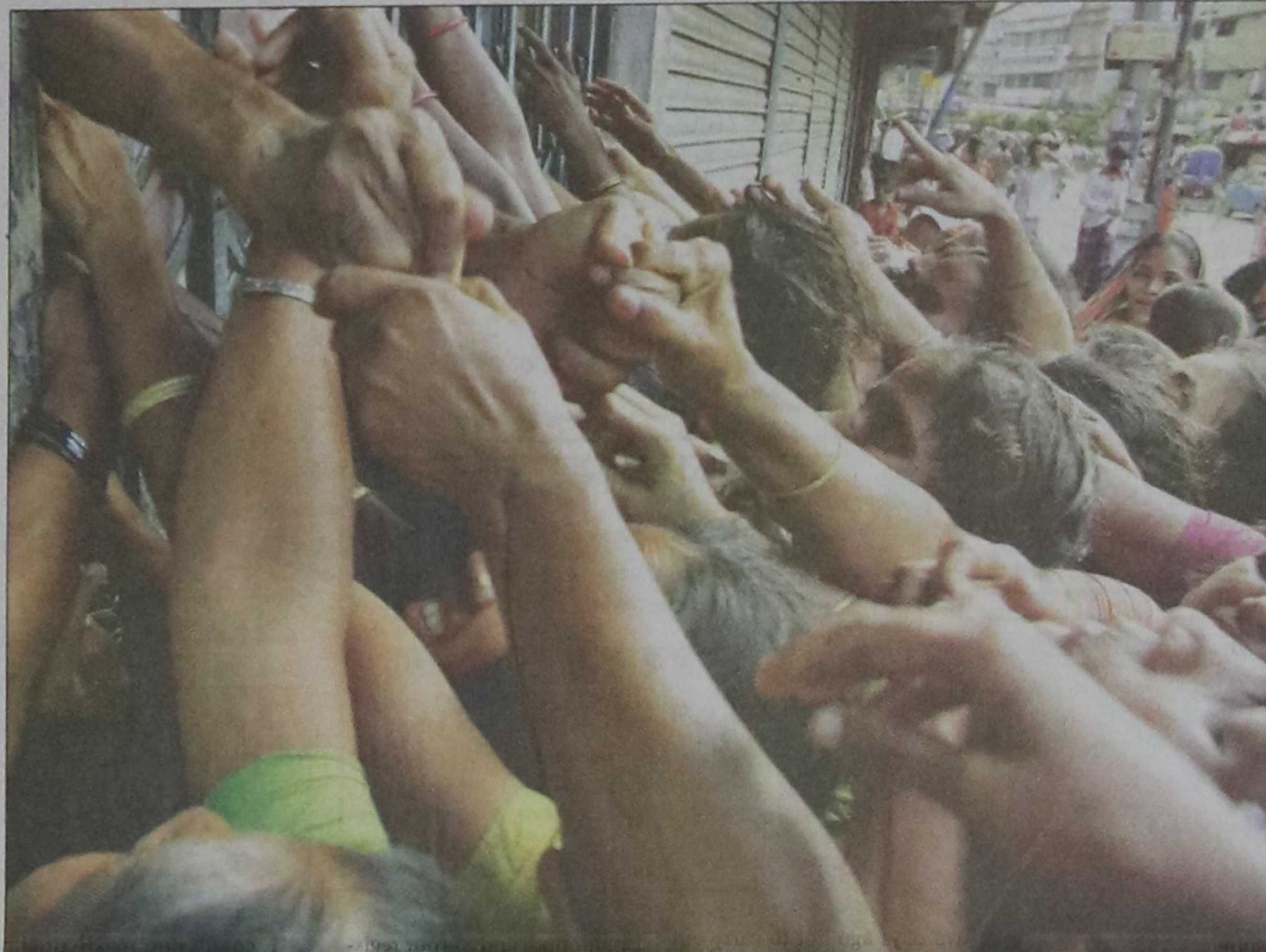
Destitute people scramble to receive zakat in front of a house at North South Road in the city yesterday.

In addition, 1,000 police will be on duty on September 28, the day of Bijoya Dashami, to stave off any untoward incident, according to the official sources.