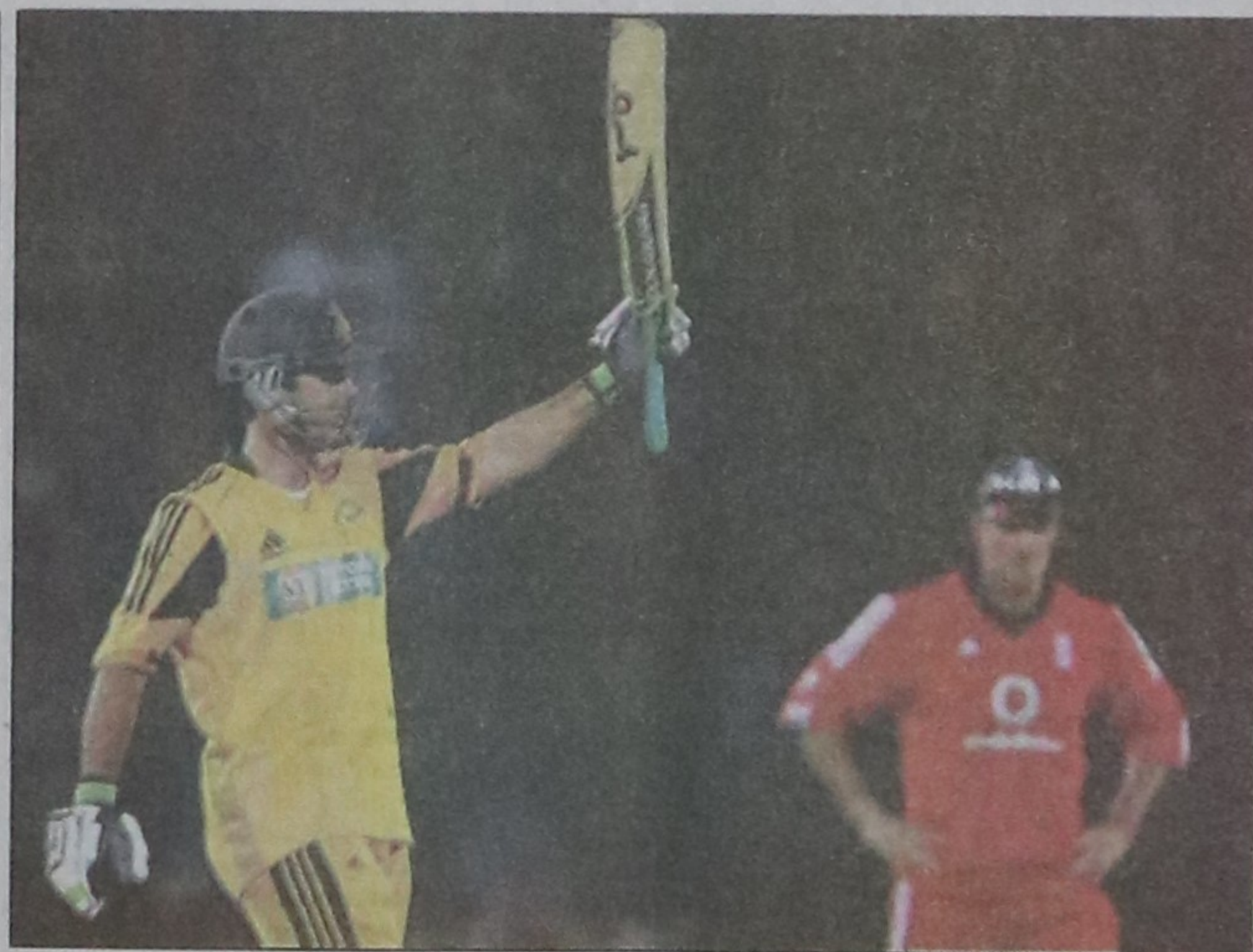
Ricky Ponting (L) gave Andrew Strauss plenty to think about during the 5th ODI between England and Australia at Trent Bridge on Tuesday.