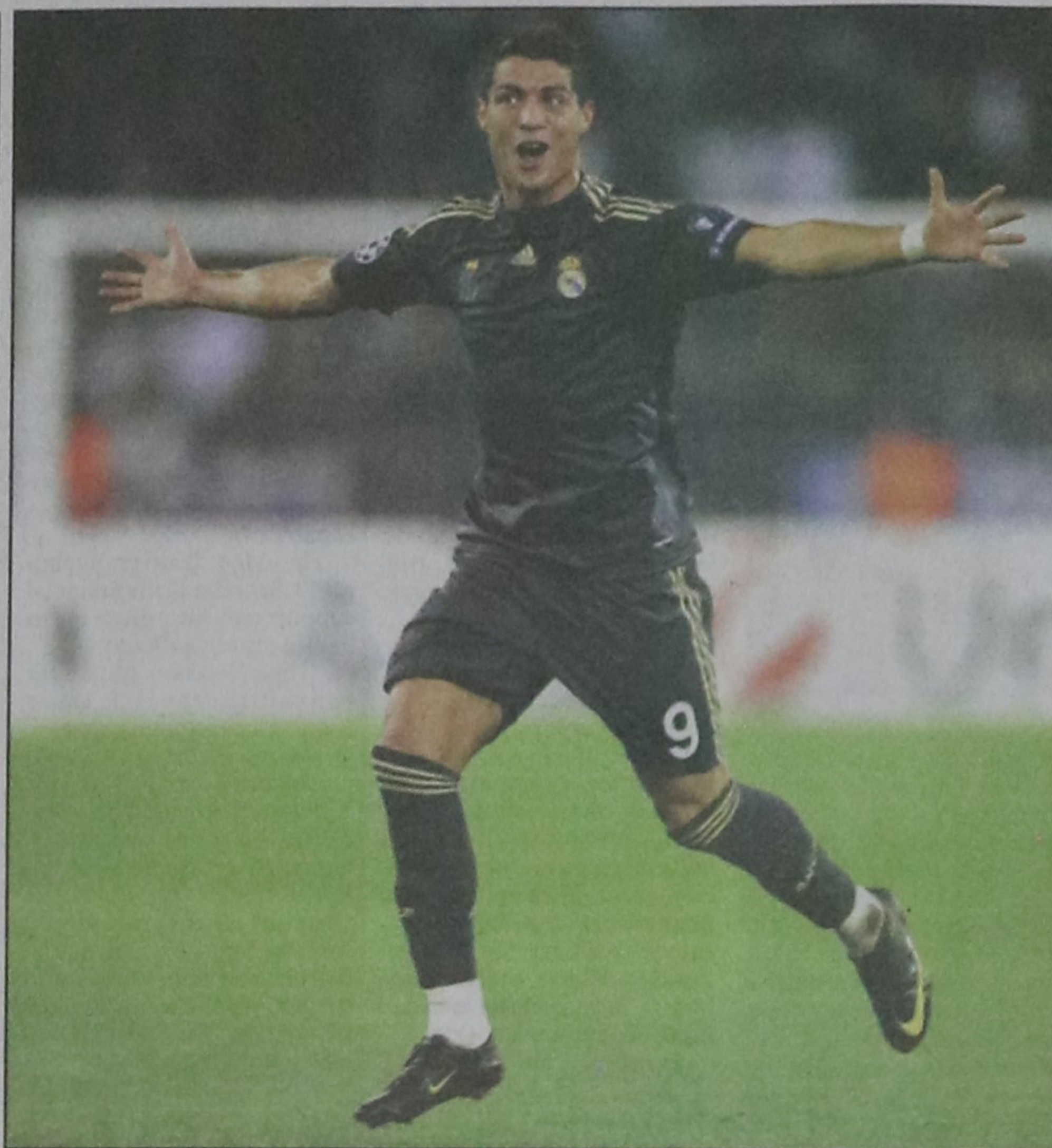
Real Madrid's world record signing Cristiano Ronaldo celebrates his second goal against FC Zurich during their Champions League match in Zurich on Tuesday.