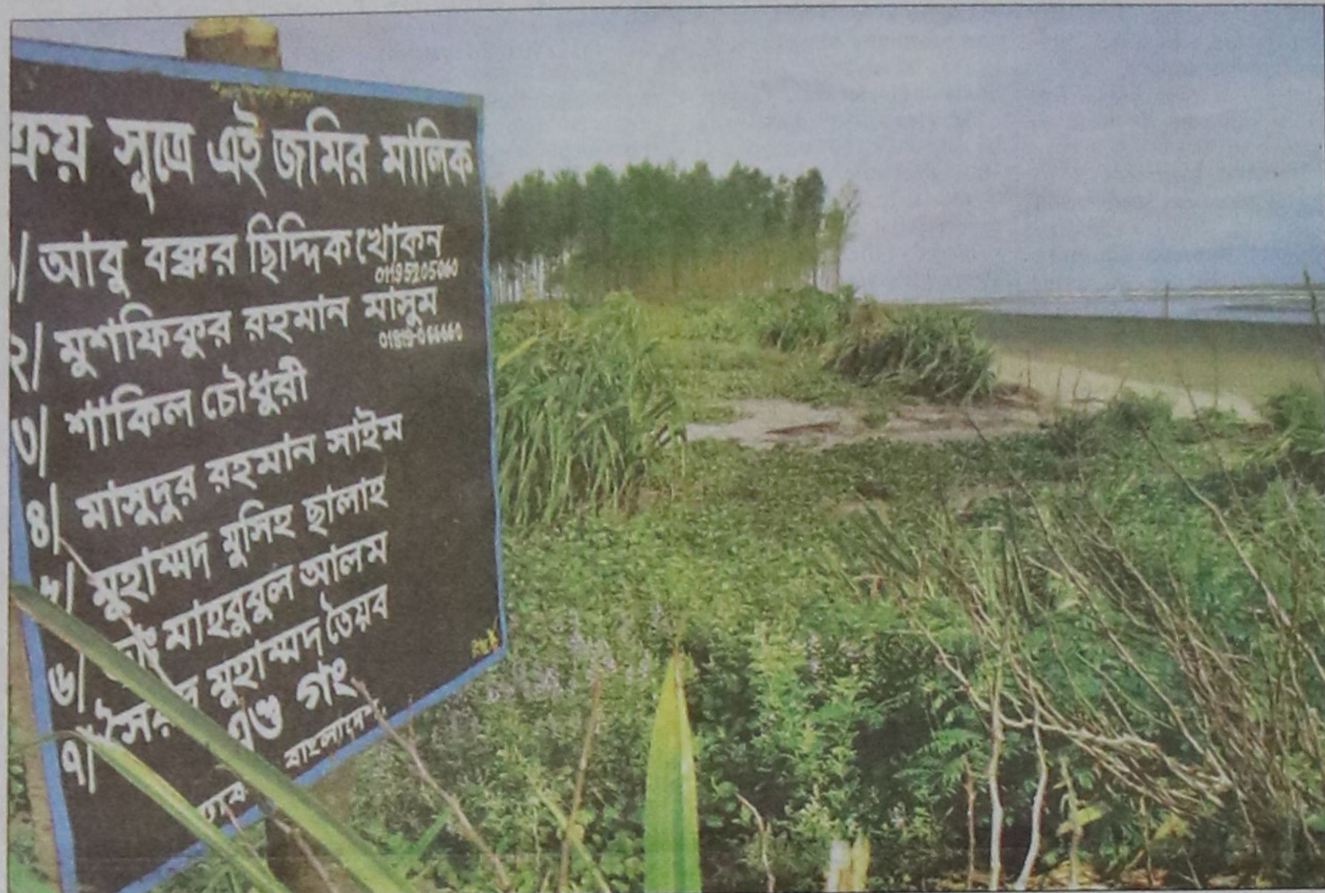
A certain quarter put up a signboard claiming the Jhau garden, created by the Coastal Forest Department along the Kachubania beach in Teknaf, as their property.