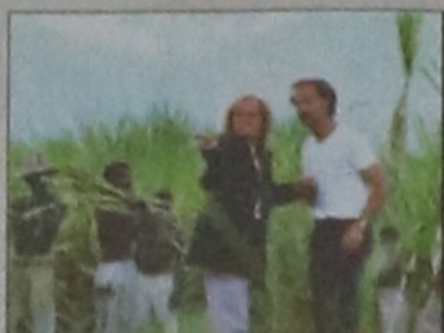
Photo Exhibition On the occasion of 60 th birth anniversary of Werner Herzog Title: Film Must be Physical Venue: Goethe-Institut Bangladesh, H 10, Rd 9, Dhanmondi Date: Sep 16-Oct 8

Solo Painting Exhibition Artist: Shahabuddin Venue: Gallery Chitrak, H 21, Rd 4, Dhanmondi Inauguration: September 18 Time: 6pm