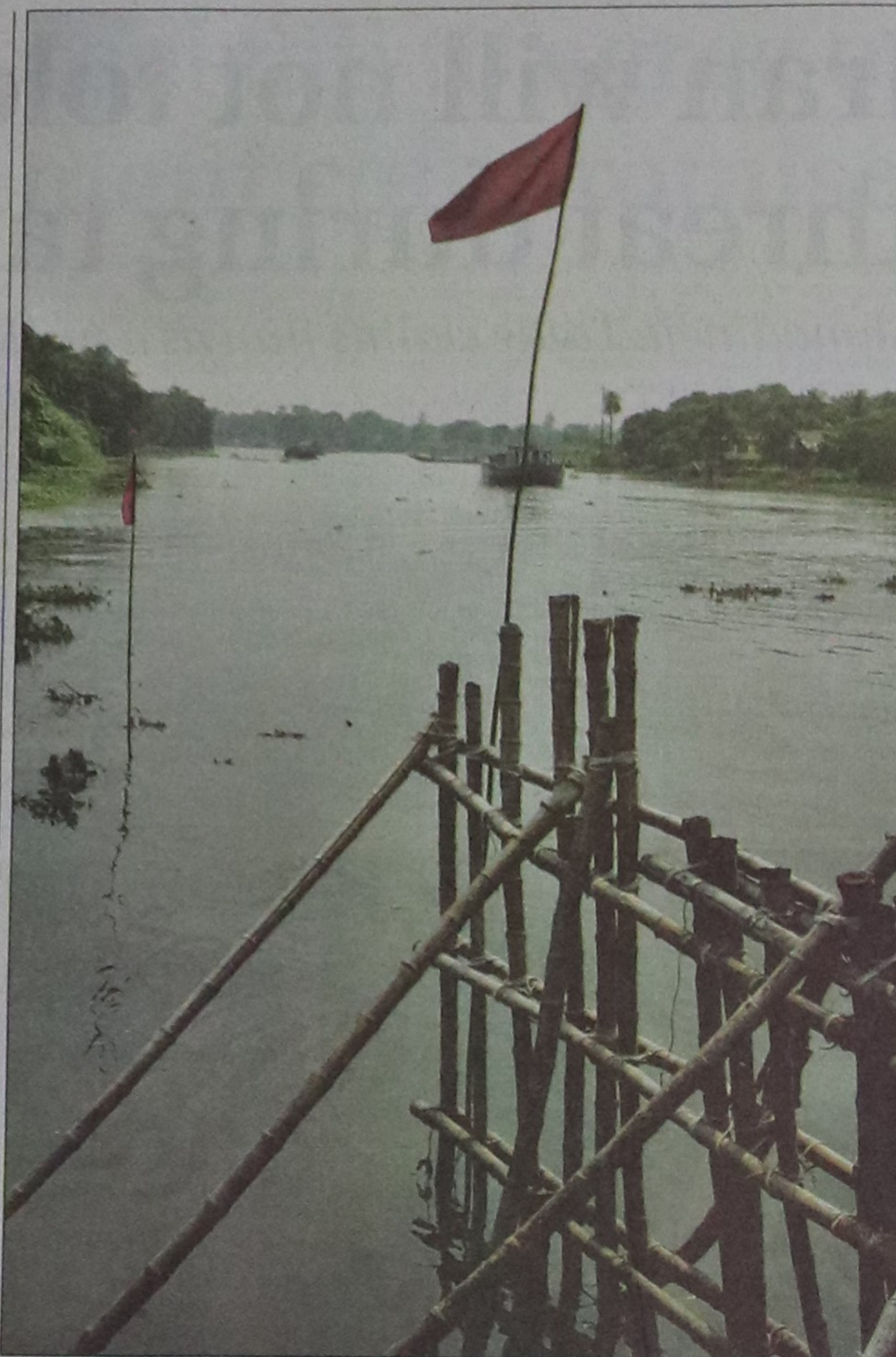
Narayanganj district administration yesterday launched a survey on the river Balu to demarcate a seven-kilometre stretch of its bank in line with a court directive to draw the actual limits of four rivers around Dhaka. (Story on page 1)

She also demanded the government allocate Tk 500 to compensate the global recession-hit as well as retrenched workers.