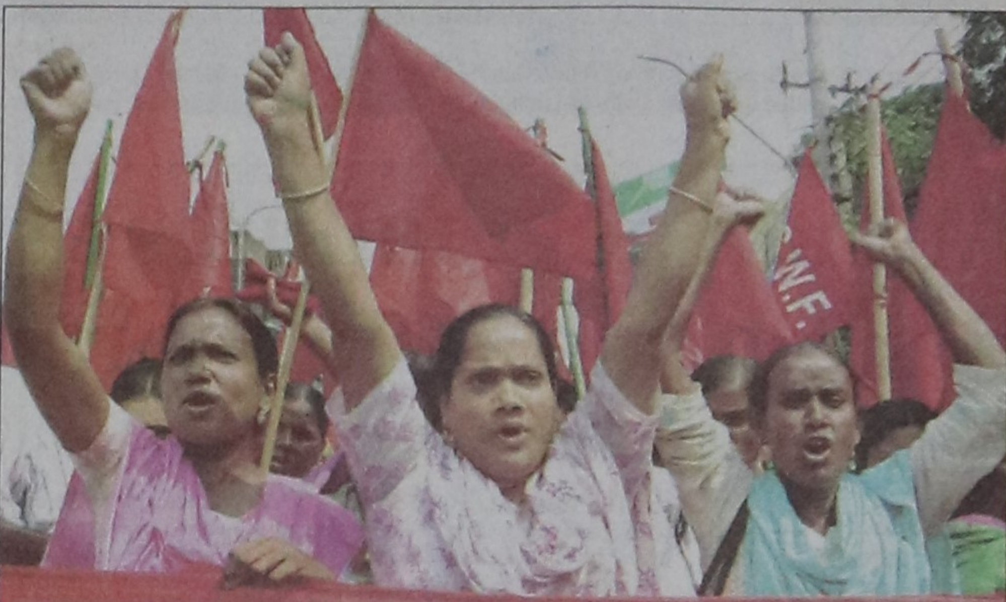
Jatiya Garment Sramik Federation takes out a procession from Mukhtang in the city yesterday demanding payment of salary arrears and Eid bonus to laid-off workers of five garment factories.

Police seized the truck. The body was sent to Jhenidah Sadar hospital morgue for autopsy.