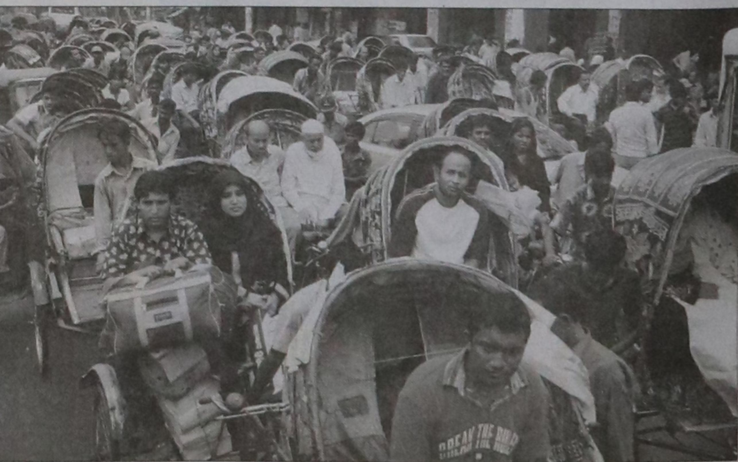
Seasonal rickshawpullers come to the port city of Chittagong from across the country to earn a living. But they do not know proper traffic rules or follow the regulations, leading to massive congestion on the city streets. The photo was taken from Rifles Club area yesterday.

The police said Selim is an accused in five cases.