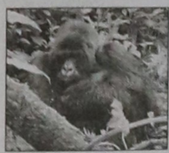
A handout photo provided yesterday by the Rwanda Development Board (RDB) Tourism and Conservation and taken on April 1 shows a silverback gorilla, called Titus, in National Volcano Park.