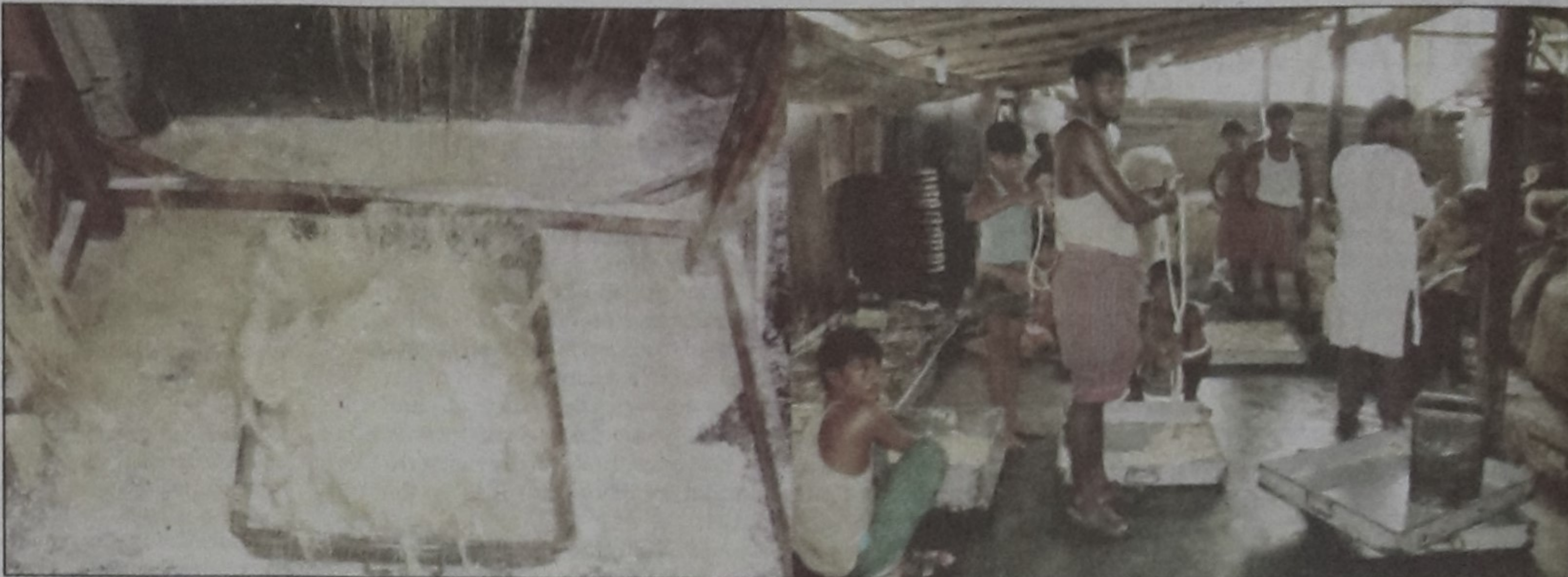
Workers busy preparing vermicelli, a highly popular delicacy especially during the Eid festival, at a factory in Jhalakathi. Most of the manufacturers, however, care little about quality and hygiene as profit is their prime target.

"The HSC examinees whose names have been printed in the tabulation sheet as successful candidates are being treated as 'passed' in the examination. The university authorities have been informed of the situation of Moulvibazar Government Women's College centre. Mark sheets of the examinees are likely to reach Moulvibazar within the current month (September). If the students get mark sheet, they will get scope to get admission into higher courses without certificate," he said.