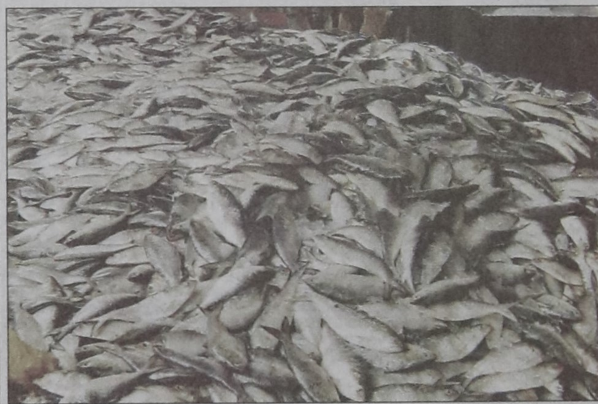
Huge quantity of hilsa is kept for sale at Fisheryghat wholesale market in Cox's Bazar town yesterday as good catches of the popular fish are being netted in the sea.

Rafiqul complained to a Rab patrol team that reached the spot after a few minutes and lodged a mugging case with Bagmara Police Station.