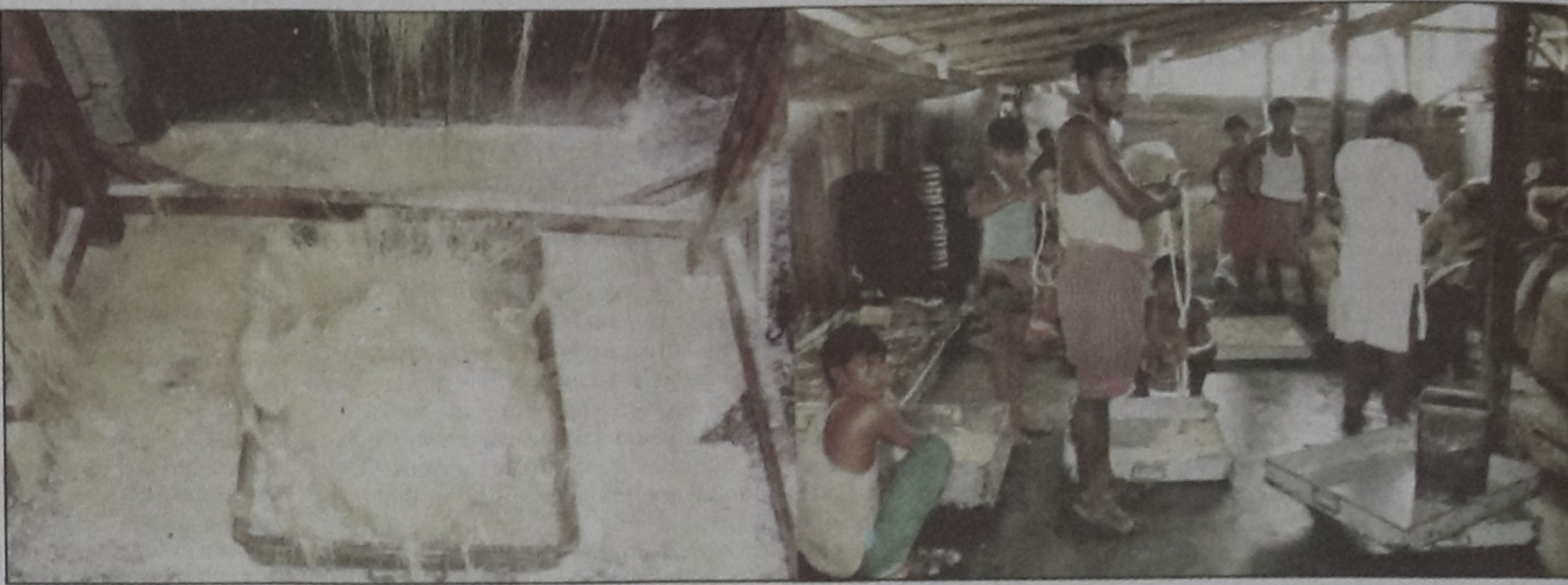
Workers busy preparing vermicelli, a highly popular delicacy especially during the Eid festival, at a factory in Jhalakathi. Most of the manufacturers, however, care little about quality and hygiene as profit is their prime target.

"The HSC examinees whose names have been printed in the tabulation sheet as successful candidates are being treated as 'passed' in the examination. The university authorities have been informed of the situation of Moulvibazar Government Women's College centre. Mark sheets of the examinees are likely to reach Moulvibazar within the current month (September). If the students get mark sheet, they will get scope to get admission into higher courses without certificate," he said.