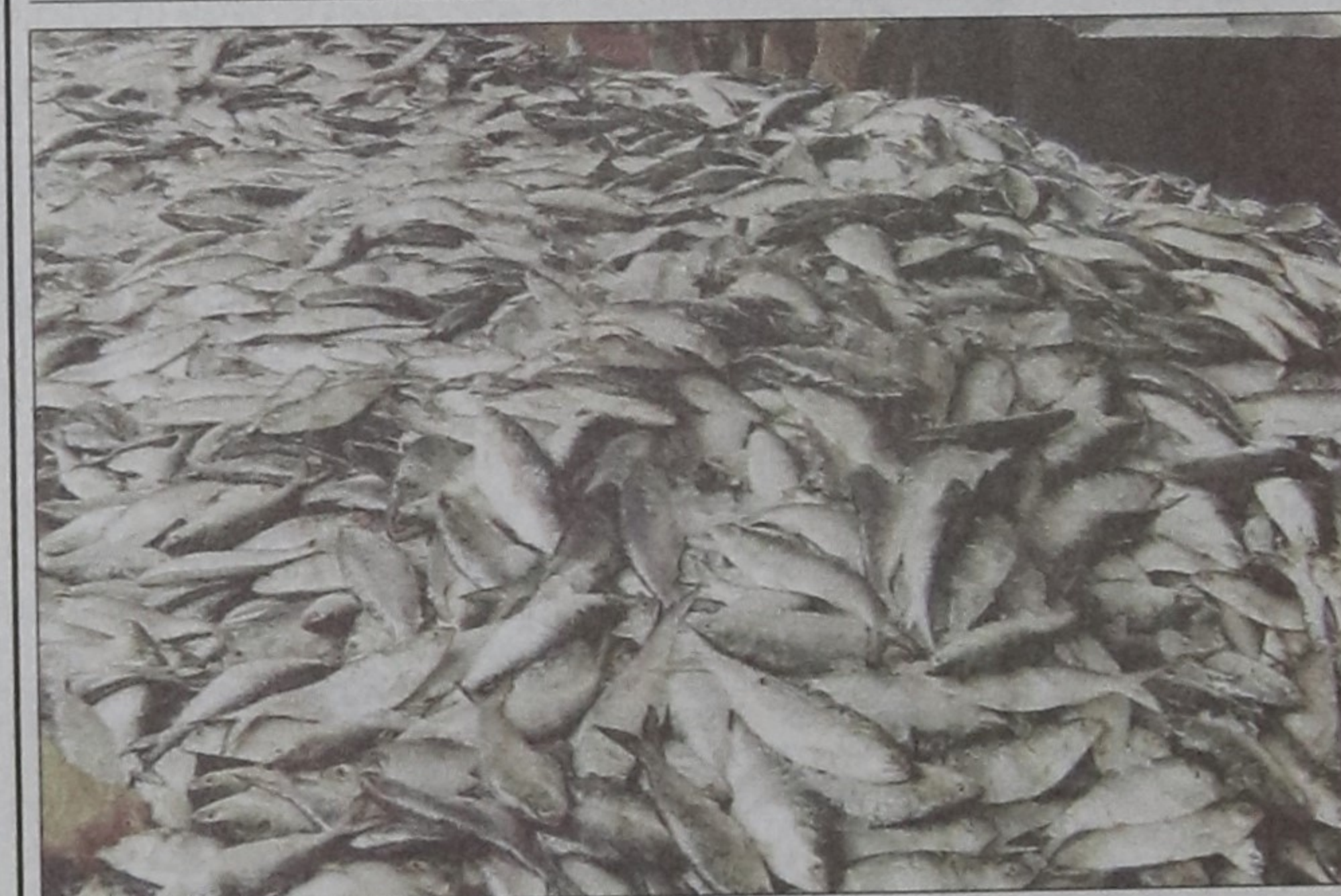
Huge quantity of hilsa is kept for sale at Fisheryghat wholesale market in Cox's Bazar town yesterday as good catches of the popular fish are being netted in the sea.

Rafiqul complained to a Rab patrol team that reached the spot after a few minutes and lodged a mugging case with Bagmara Police Station.