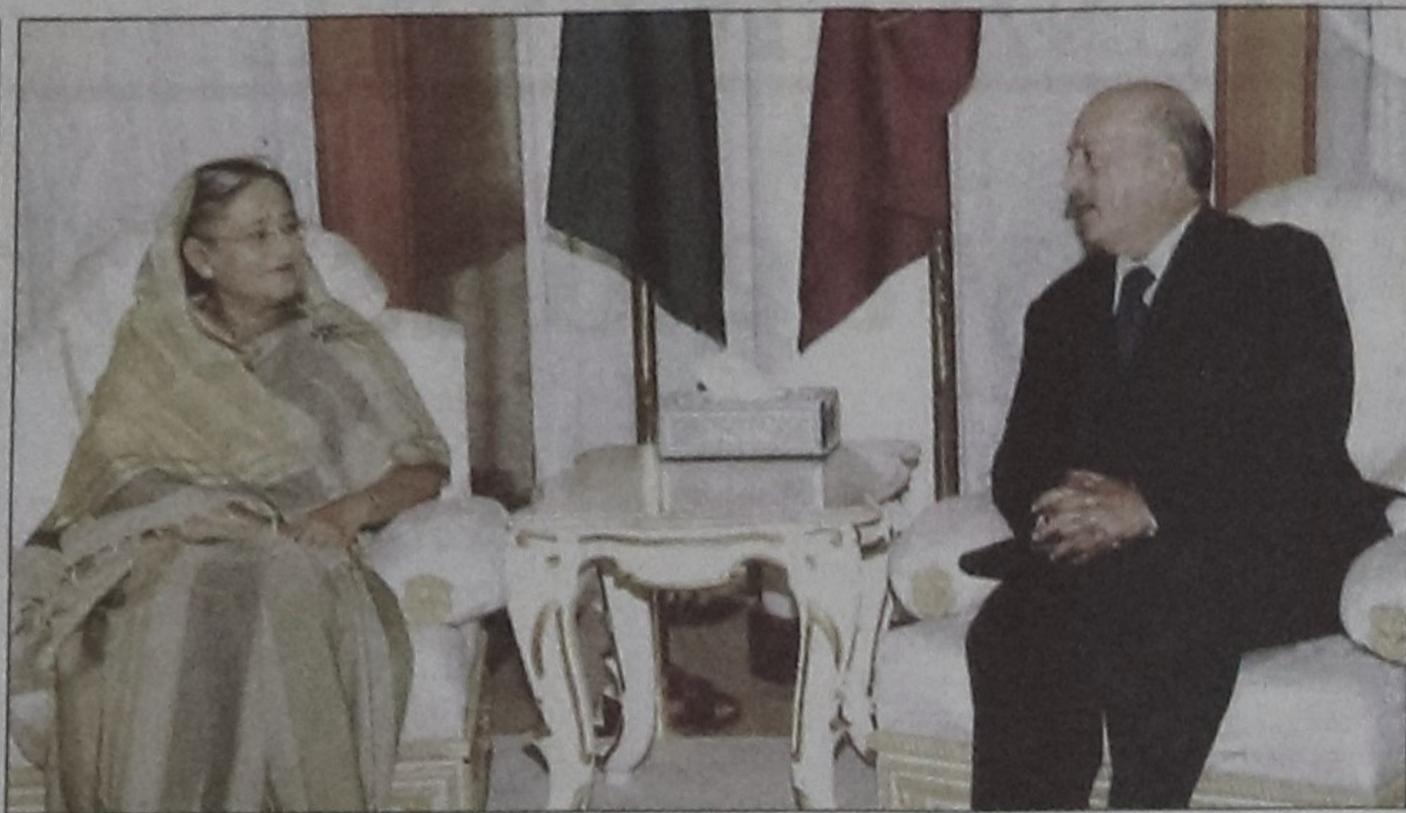
Outgoing Pakistani High Commissioner Alamgir Bashir Khan Babar pays a farewell call on Prime Minister Sheikh Hasina at her official residence Jamuna in the city yesterday.

They called for discussing the issue in parliament and follow the competitive modus operandi for approval to explore gas in the offshore blocks in order to ensure transparency in the process. City unit leader Siddiqur Rahman presided over the meeting.