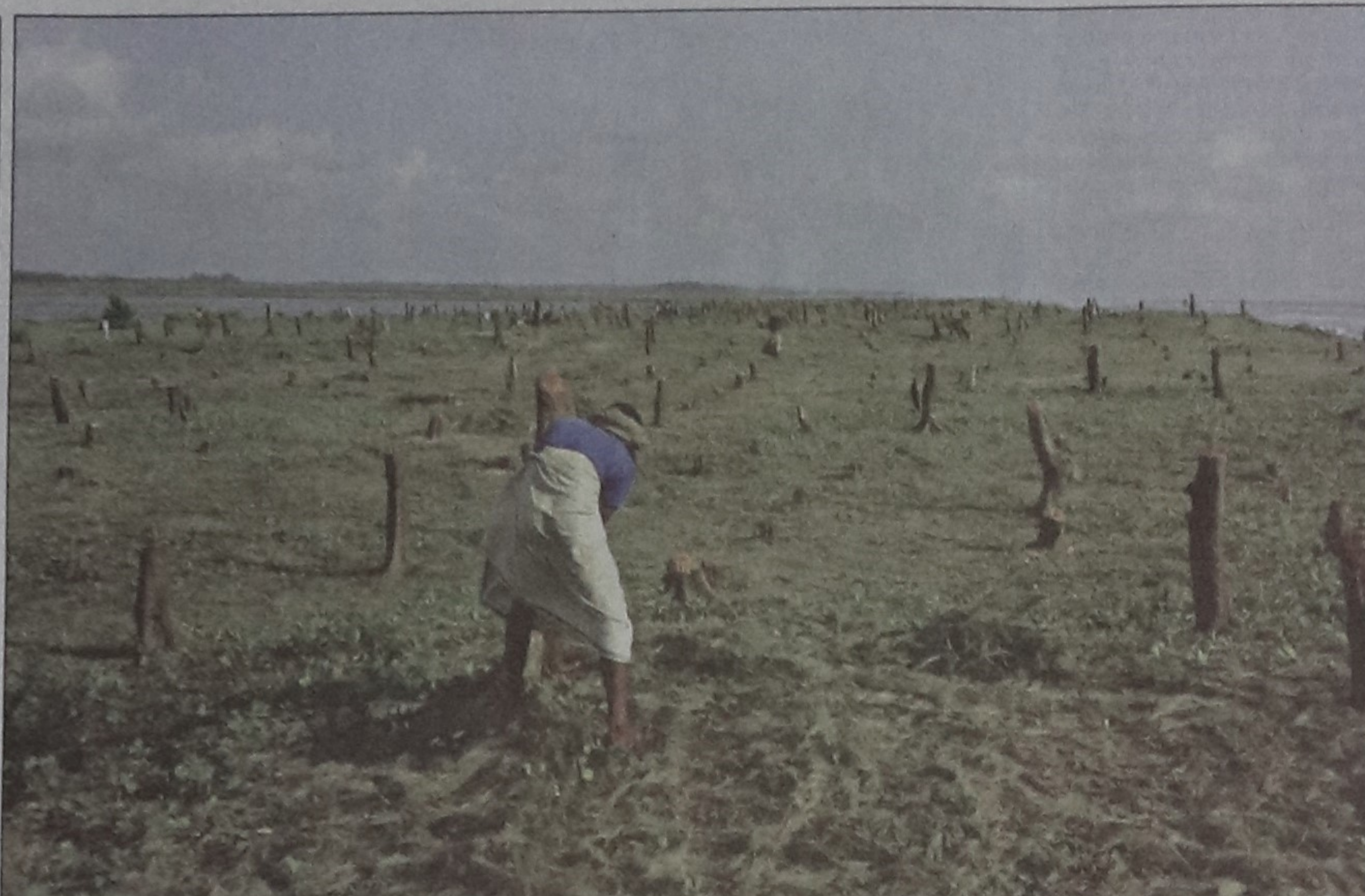
A 10-kilometre stretch in Teknaf beach of Cox's Bazar has turned barren as around 30,000 Jhau trees have been felled by a section of influential locals in last seven days.