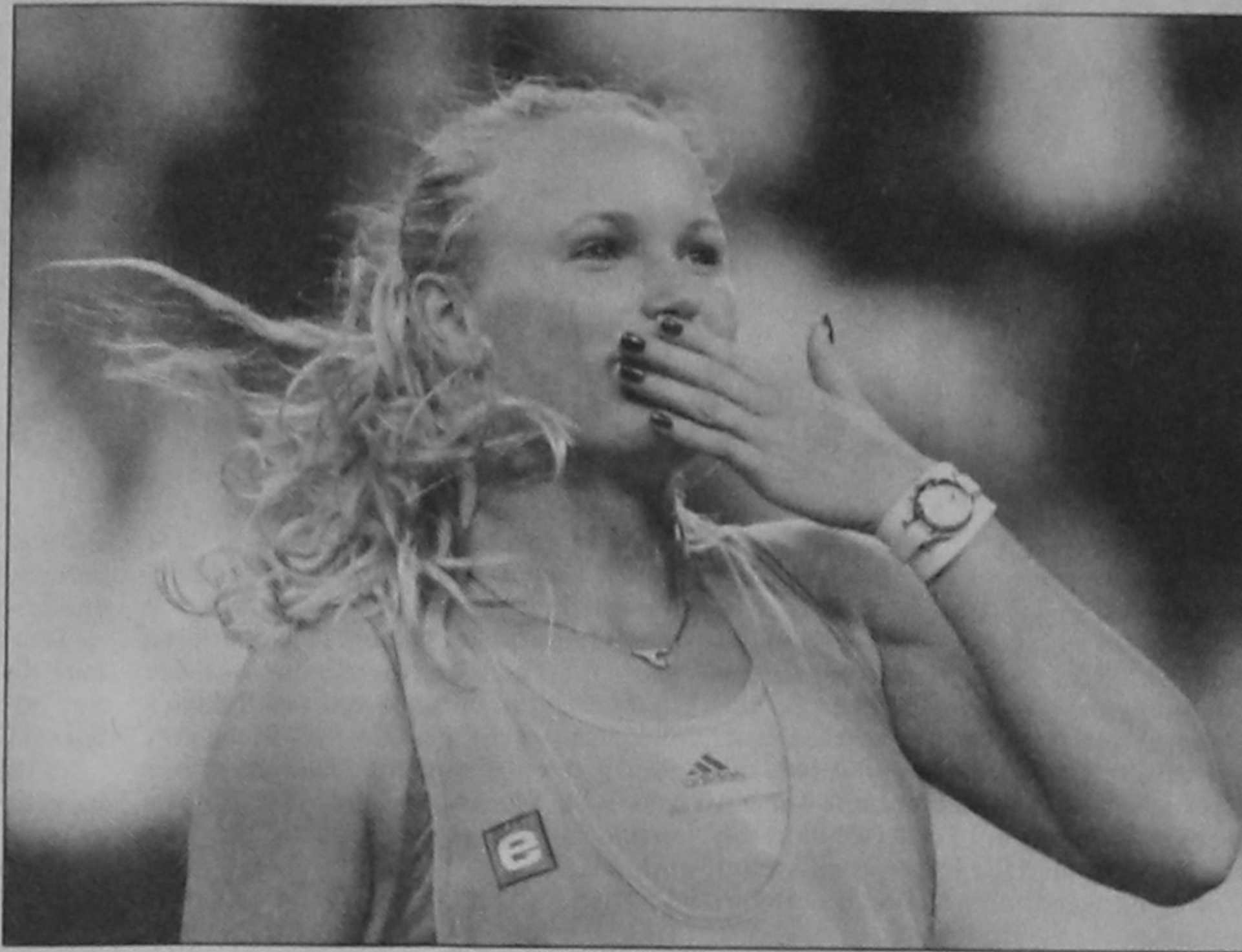
Caroline Wozniacki of Denmark blows a kiss after her victory over Melanie Oudin of the United States at the Flushing Meadows on Wednesday.

Jean Genevieve Garmerin was the first female parachutist, jumping from a hot air balloon in 1799.