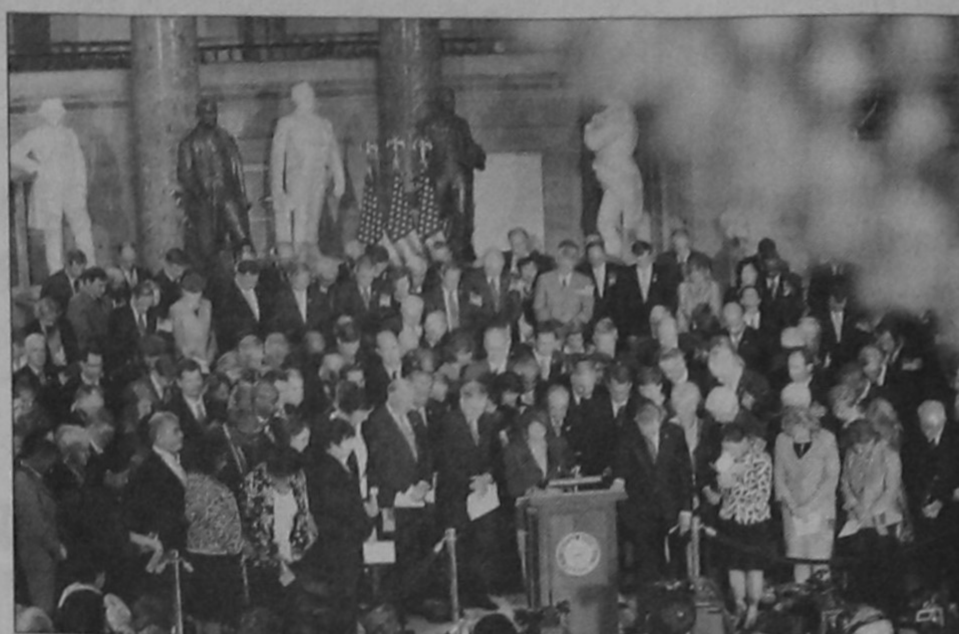
Members of Congress participate in a remembrance ceremony to honour the victims of 9/11/2001 at the US Capitol on Wednesday in Washington, DC. Earlier in the day family members of those lost on United Airlines Flight 93 attended a Congressional plaque dedication.

want to wage war on Muslims, wants to fight poverty, and bolster democracy in Afghanistan. "Since the way to victory is to isolate al-Qaeda from its potential bases of support, the United States must respond in ways that are viewed as legitimate and just," Cole added. And the undoing of the Bush system has many irate conservatives, most notably former vice president Dick Cheney, up in arms. Seen as a leading force behind anti-terror methods after the Sept 11, 2001 strikes, and a spokesman for opponents of the new US policy, Cheney charges that Obama is endangering national security.