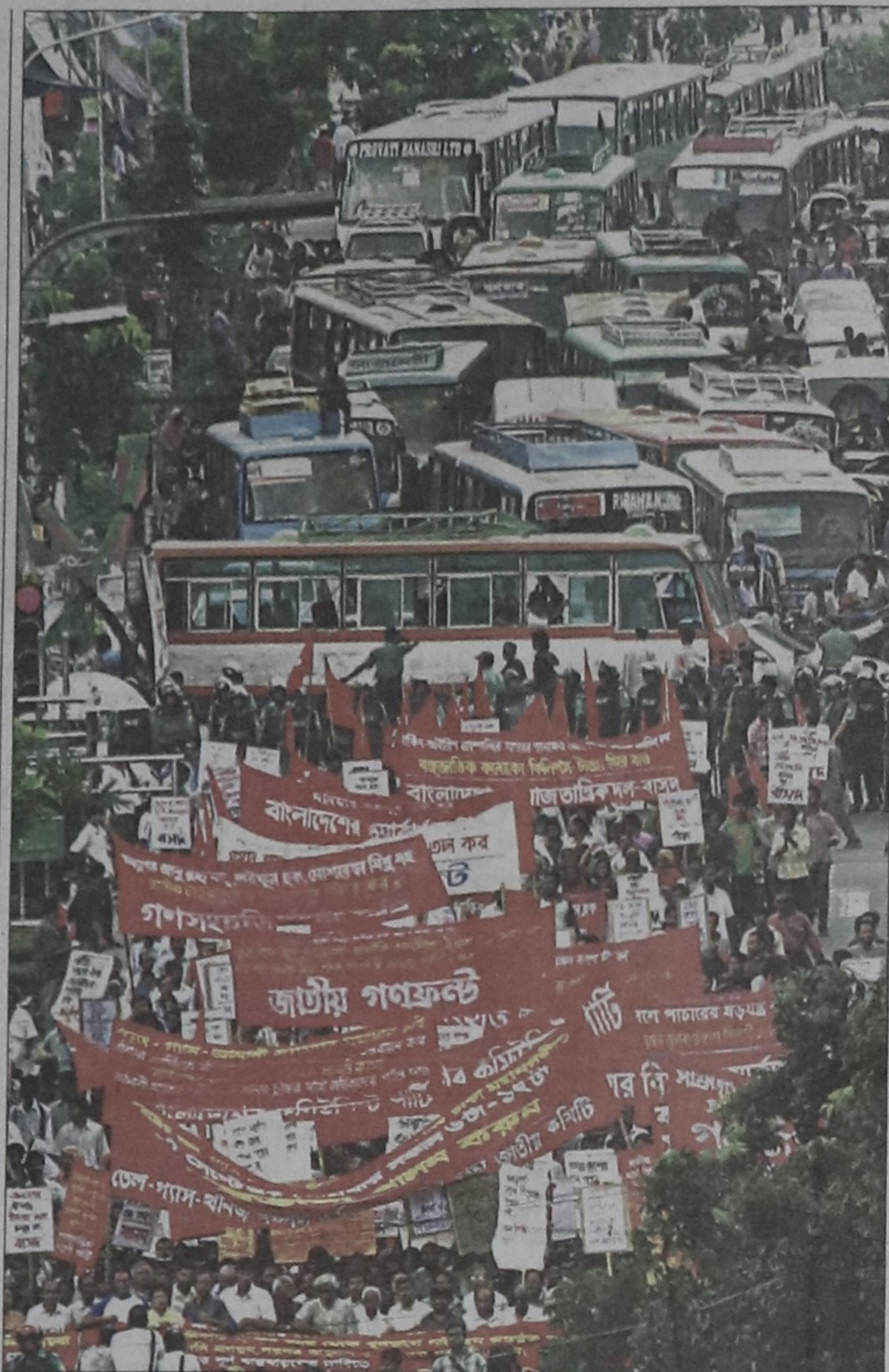
Members of the National Committee to Protect Oil, Gas, Mineral Resources, Power and Ports march towards the Prime Minister's Office from Mukhtang in the city yesterday, causing a massive traffic congestion. The committee took out the procession in protest against the government decision to lease out three offshore gas blocks to multinational companies.

He was taken to Satkhira Sadar Hospital and later shifted to Khulna 250-bed Hospital where he succumbed to his injuries early yesterday.