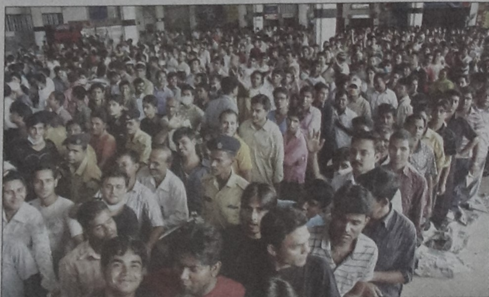
Home-bound passengers wait in long queues at Kamalapur Railway Station in the city to buy tickets of intercity trains.

Former state minister for home Tanjim Ahmad Sohel was made a member of the parliamentary standing committee on the foreign ministry while BNP lawmaker and former speaker Jamiruddin Sircar was inducted into the parliamentary standing committee on home ministry as a member.