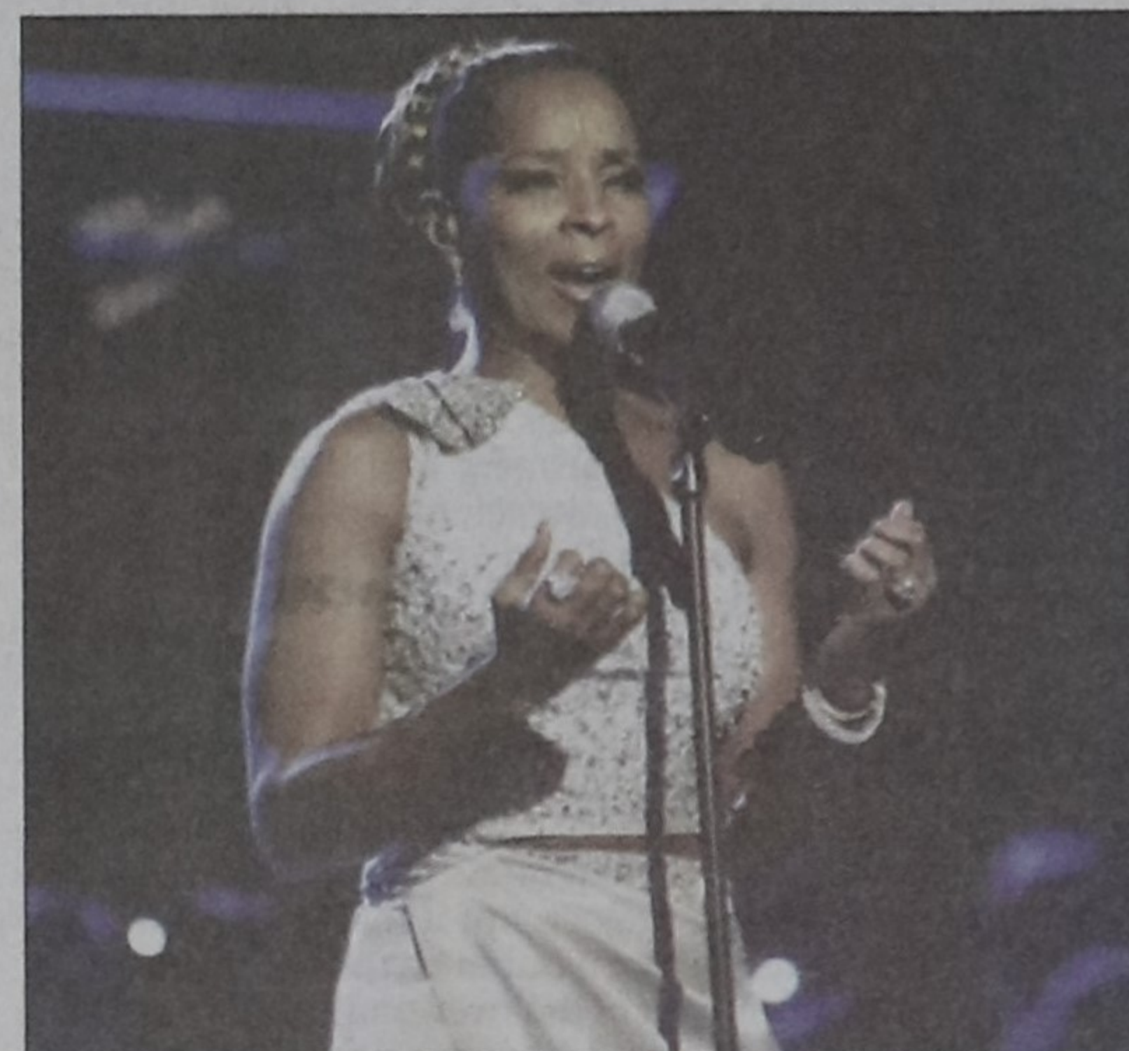
Mary J. Blige