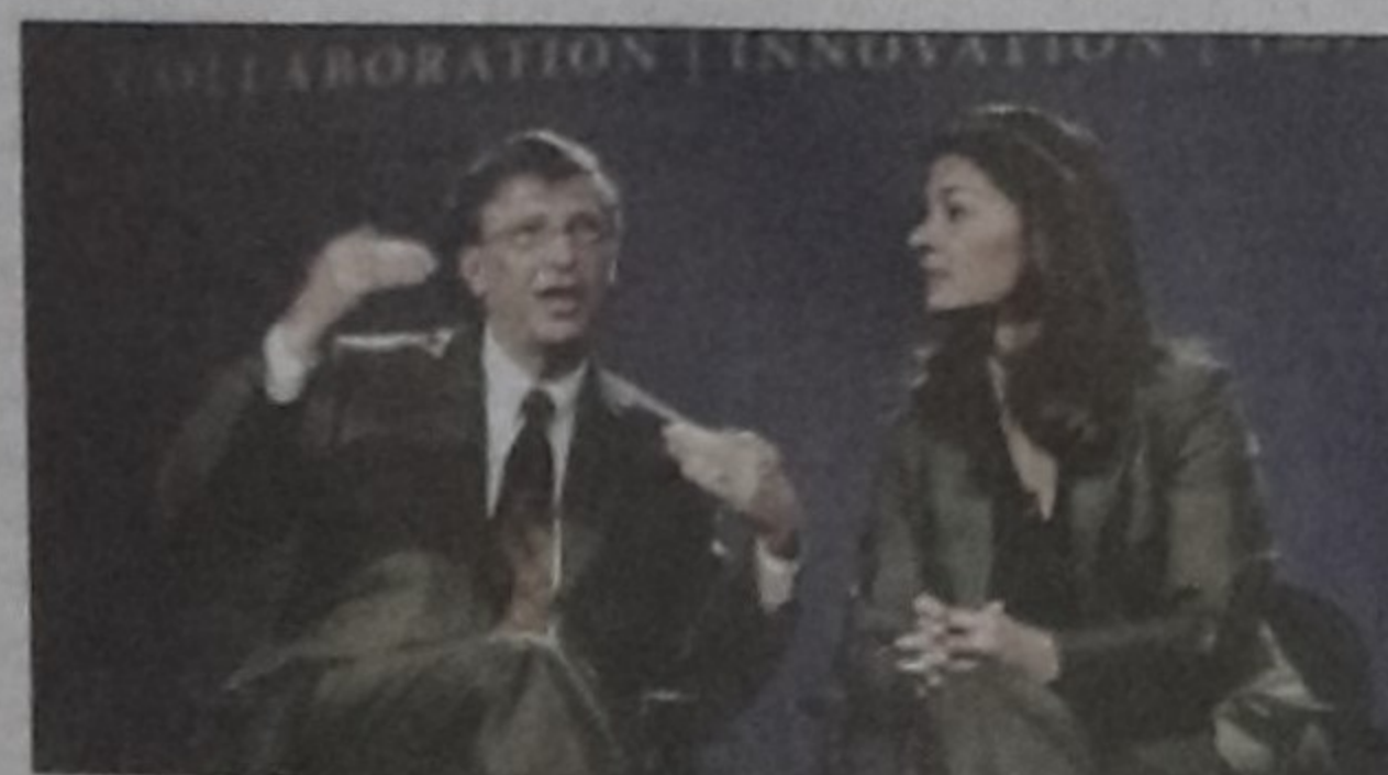
Bill and Melinda Gates

stand how the system is falling short today and how it really contradicts our commitment to equal opportunity," Gates told The Associated Press. "If we don't change it now, it will hurt the future of the country as a whole."