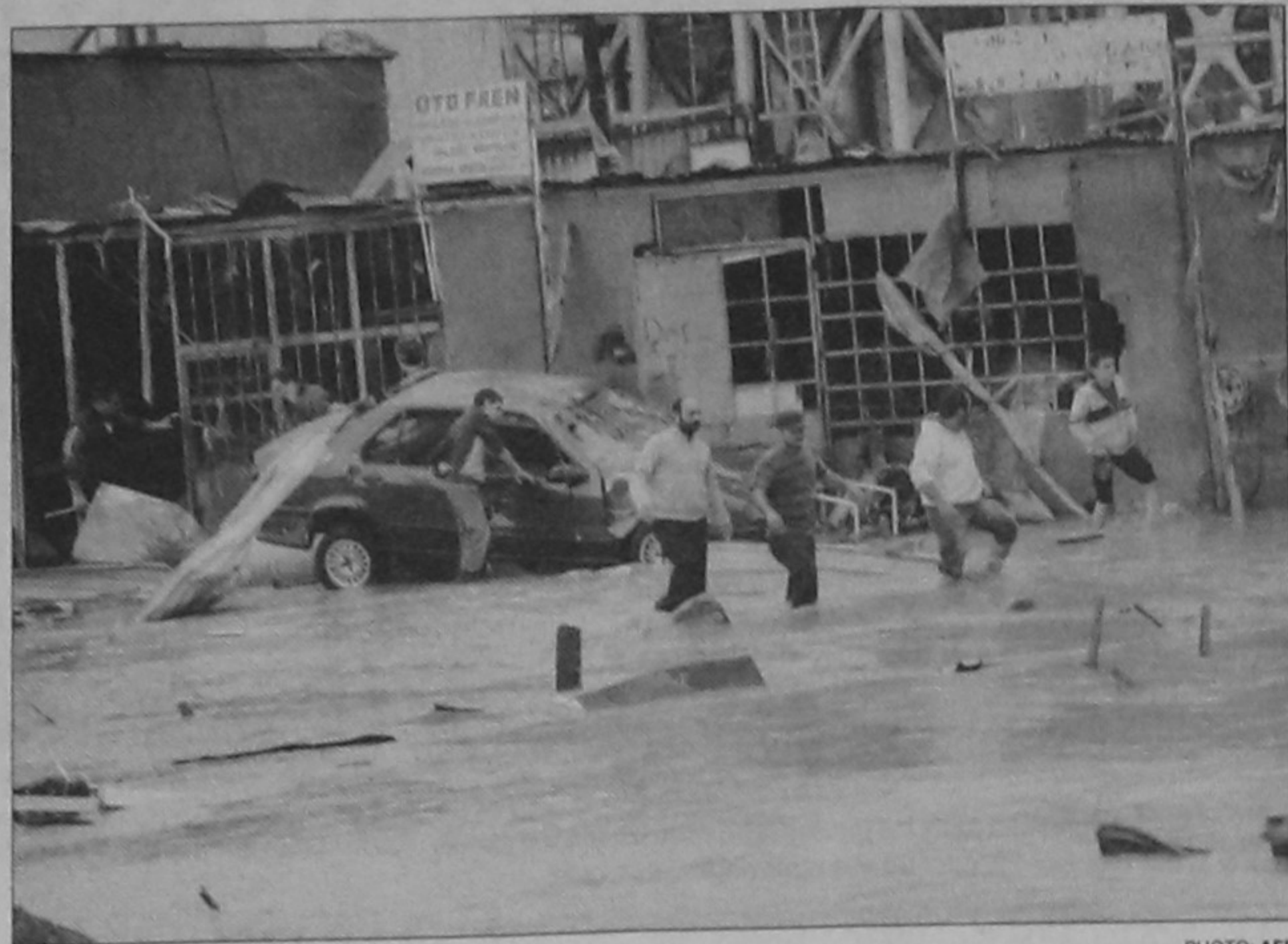
People make their way along a flooded street in Istanbul yesterday. Heavy overnight rains flooded parts of Turkey's biggest city stranding motorists and flooding arterial roads.