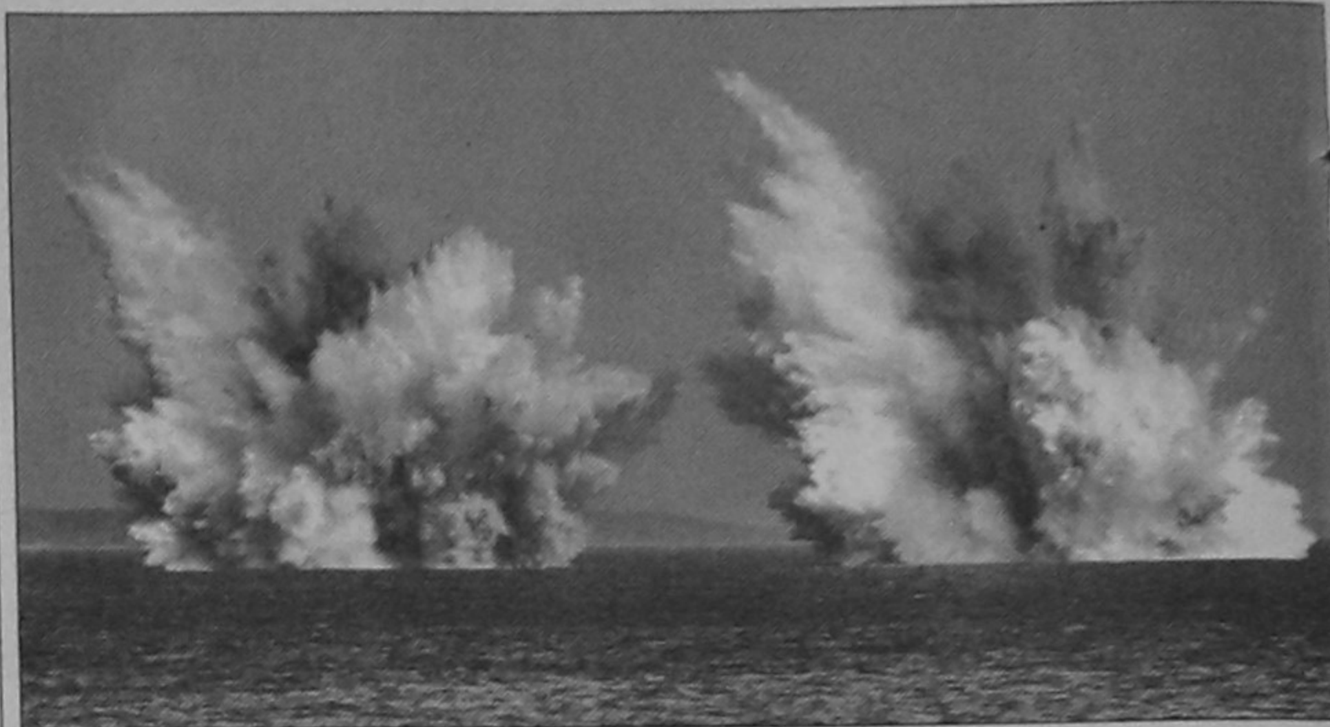
Two unexploded mines are detonated under controlled conditions in waters off Tallinn yesterday. Estonia's military discovered some 64 unexploded World War II sea mines in waters near capital Tallinn.