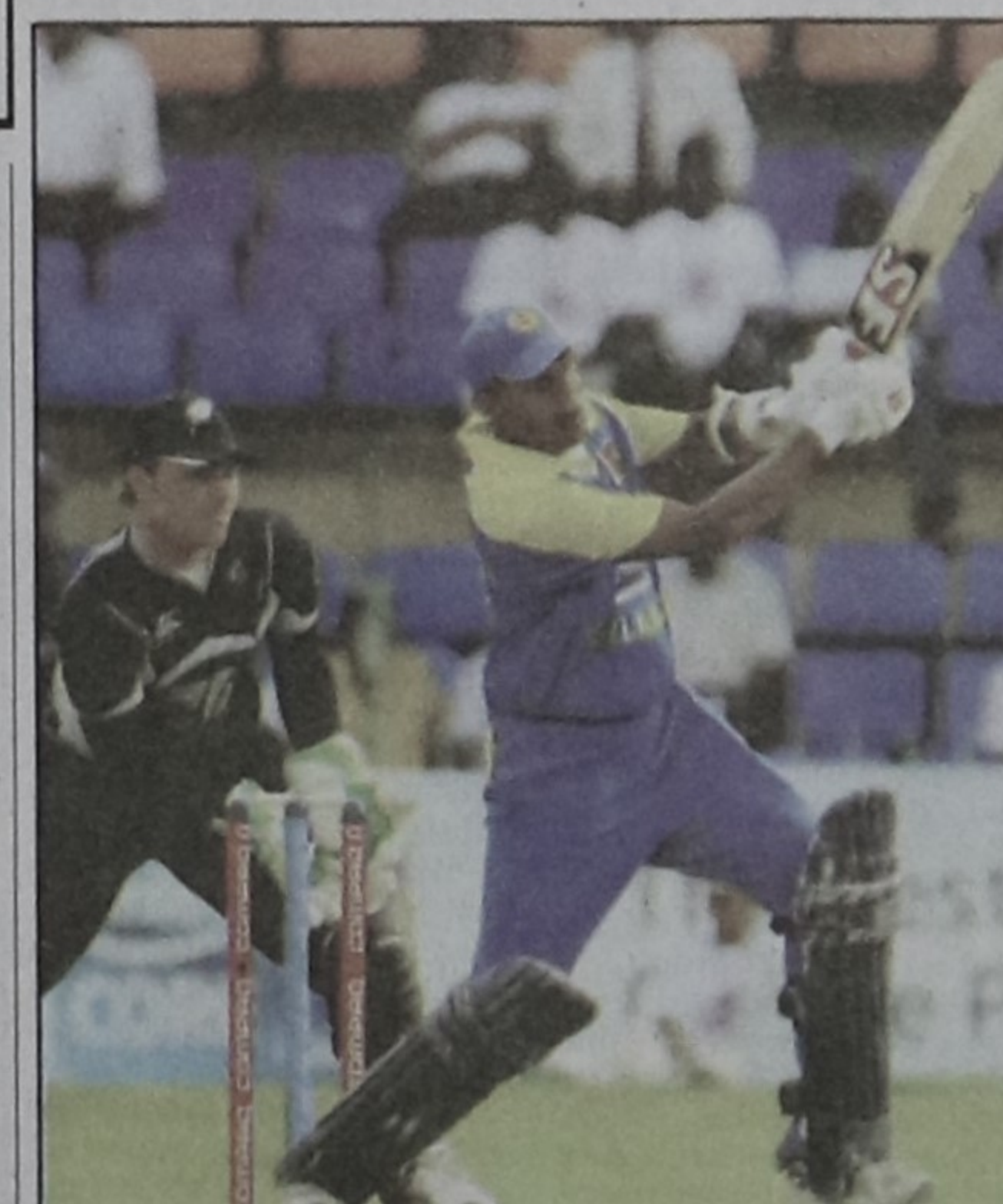
New Zealand keeper Brendon McCullum (L) looks on as Sri Lanka's middle order batsman Thilan Samaraweera lifts one over the mid on region during his 104-run knock in the opening match of the tri-series at the R Premadasa Stadium in Colombo yesterday.

The hosts were struggling at 69-5 after electing to bat on a slow pitch before Samaraweera (104) led the fightback with a vital 127-run stand for the sixth wicket with Angelo Mathews (51).