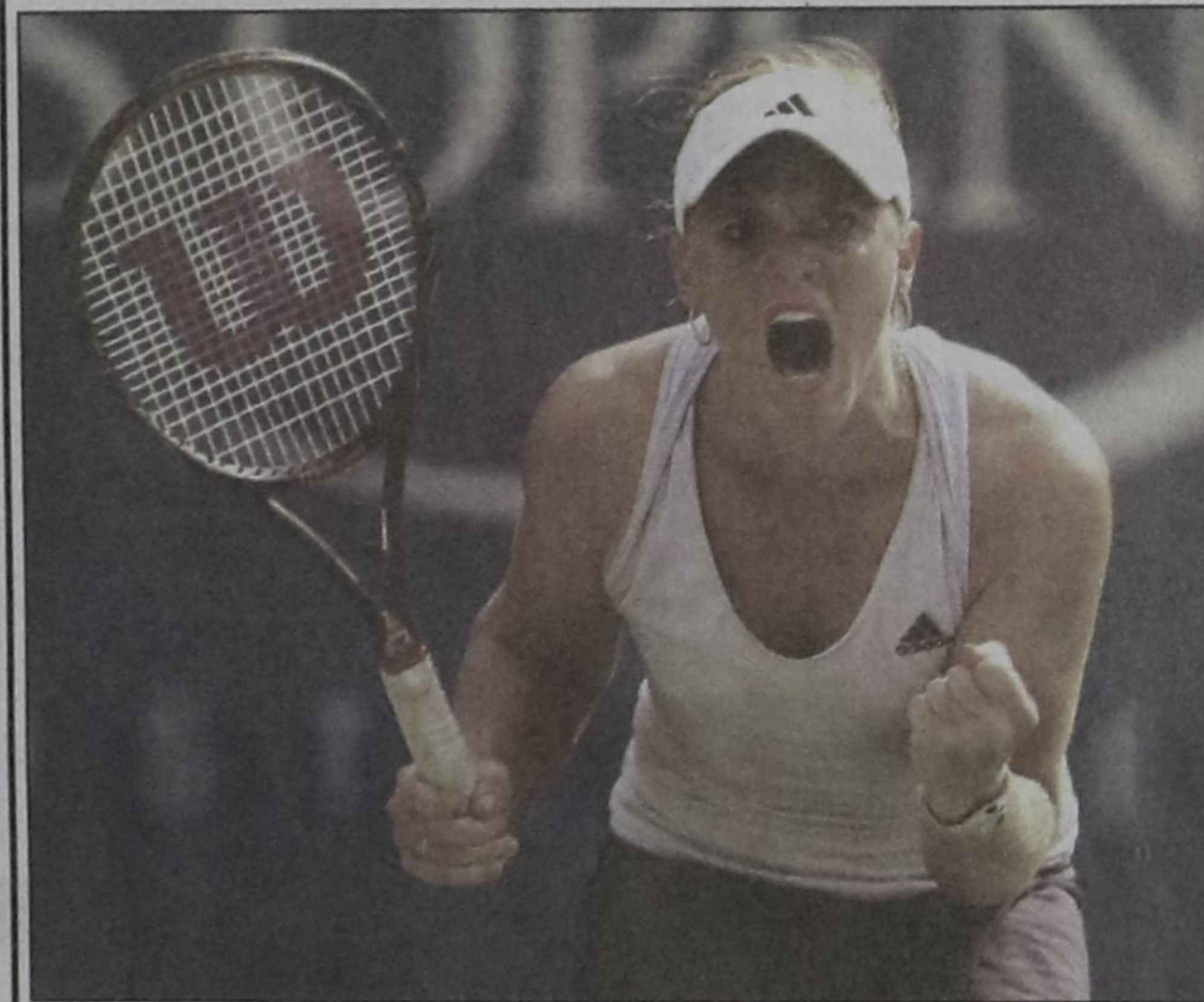
US teenager Melanie Oudin reacts after winning a point against Nadia Petrova of Russia during their 4th round match of the US Open at the Flushing Meadows in New York on Monday.