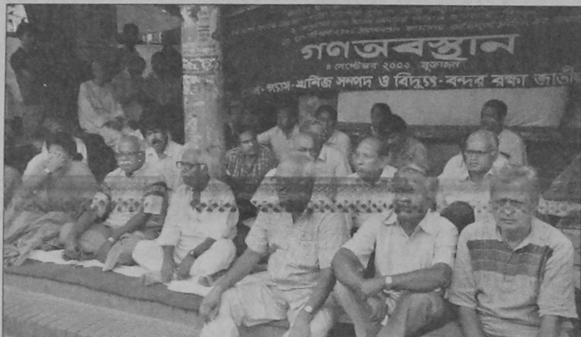
National Committee to Protect Oil, Gas, Mineral Resources, Power and Ports stages a sit-in at Muktangan in the city yesterday protesting the police action on its march towards Petrobangla office at Karwan Bazar on September 2.