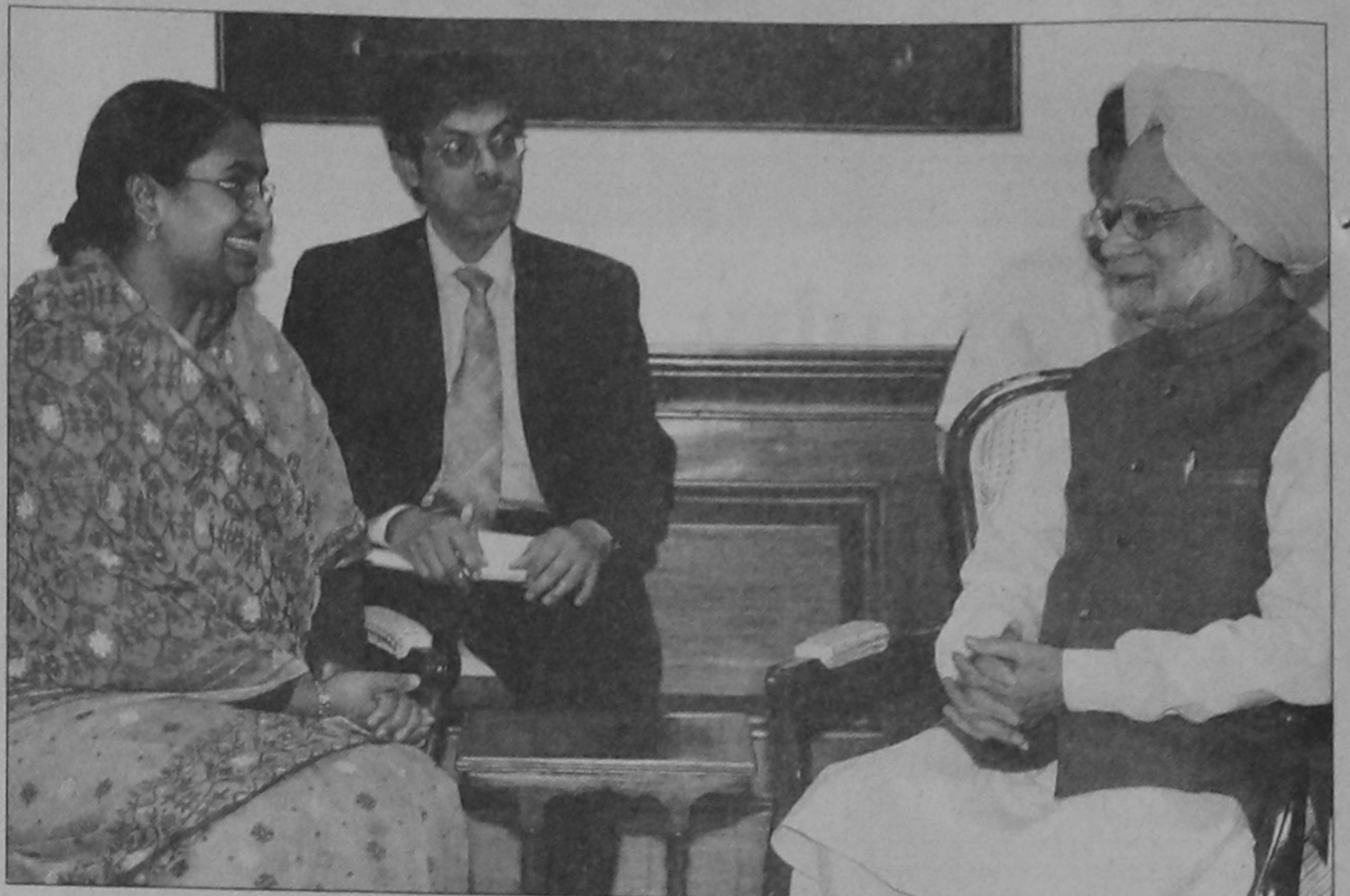
Foreign Minister Dipu Moni holds talks with Indian Prime Minister Manmohan Singh, right, at his residence in New Delhi yesterday. (Story on Page 1)