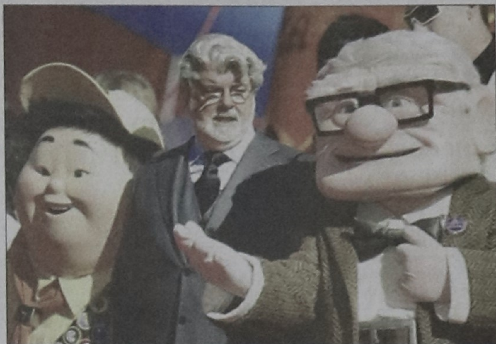
Film director George Lucas flanked by characters from a Pixar animated film upon arrival for the presentation of the Golden Lion for lifetime achievements at the Venice Film Festival on September 6, 2009.

"I think anybody else when they sell a company and the company goes on to be very successful, they would feel like they missed out," Lasseter said. "George