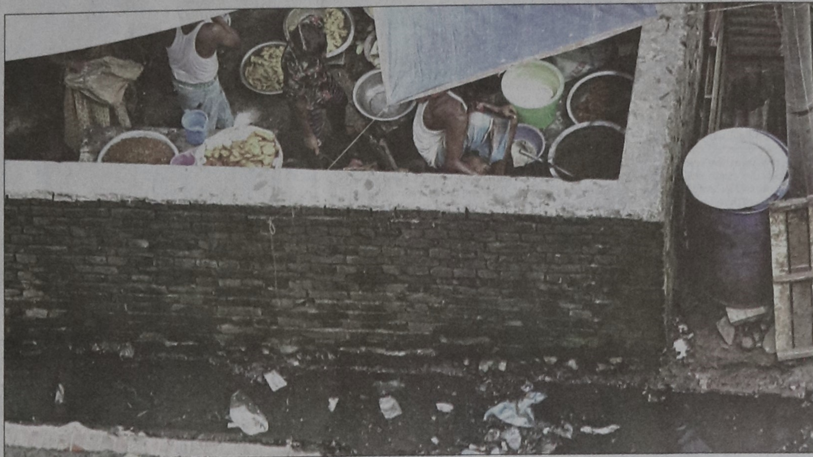
Iftar being prepared in an enclosure next to an open drain in Dilkusha of downtown Dhaka. Traders of the locality claimed the enclosure was built by the Dhaka City Corporation for people to dump garbage.