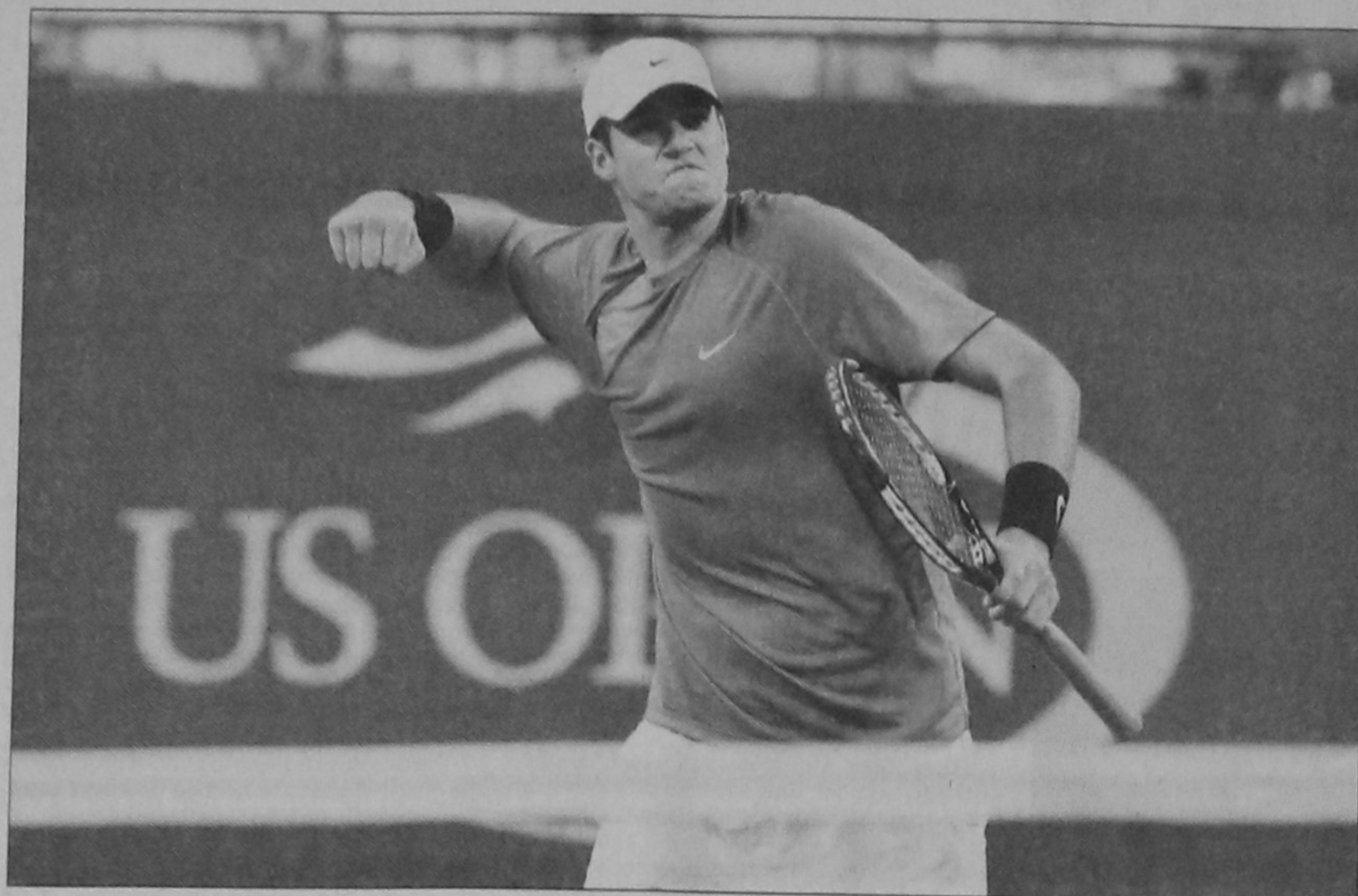
Gigantic John Isner punches the air in joy after winning a point against fellow American Andy Roddick in the 2nd round of the US Open at the Flushing Meadows in New York on Saturday.