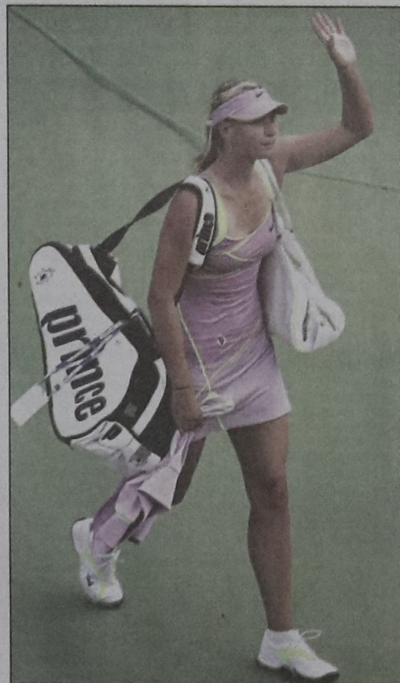
A dejected Maria Sharapova walks off the court after being defeated by US teenager Melanie Oudin in the 2nd round of the US Open at the Flushing Meadows in New York on Saturday.