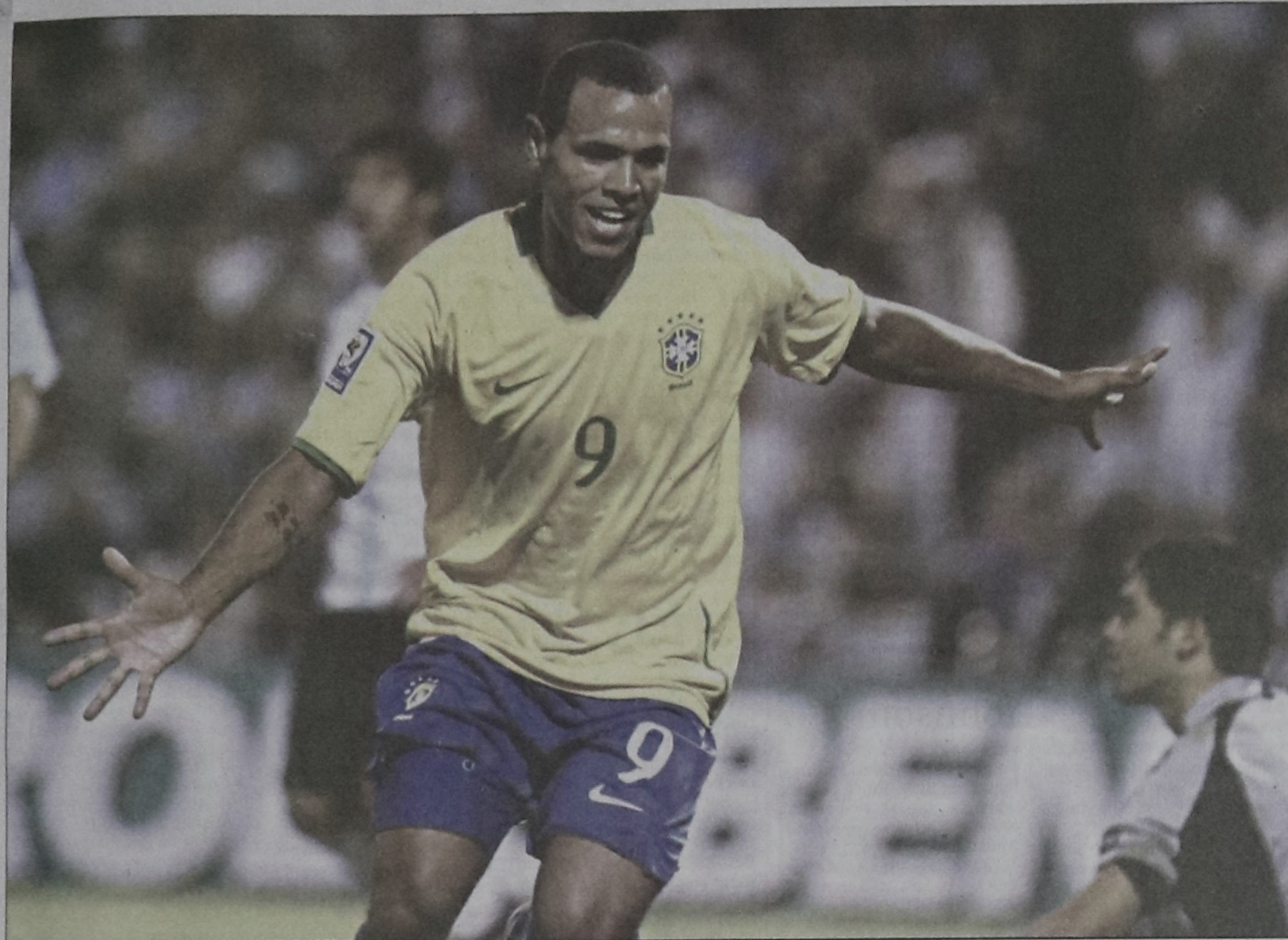
Brazil striker Luis Fabiano celebrates after scoring his second goal against arch-rivals Argentina during their World Cup qualifier at the Gigante de Arroyito stadium in Rosario on Saturday. Fabiano scored a brace as a resolute Brazil comfortably held off the challenge of the Argentines to qualify for the World Cup finals.