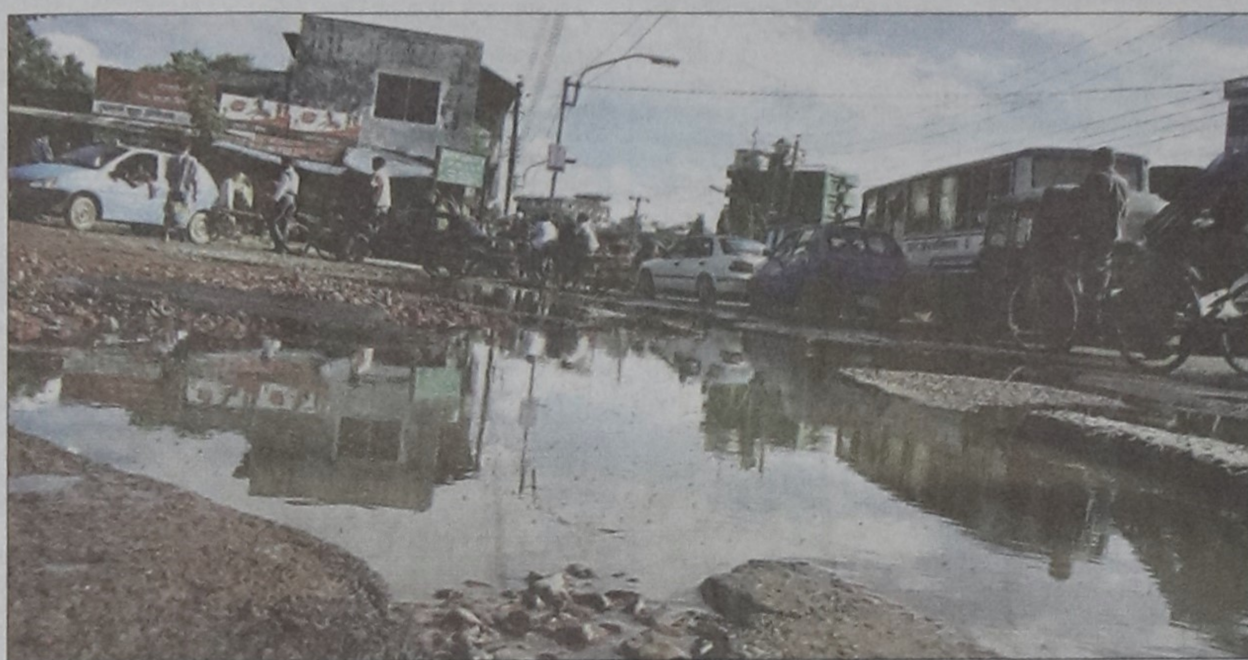
The photo shows the dilapidated condition of the road at the Mirpur Mazar Road-Beribandh intersection. The problem has remained unattended for long, prolonging people's sufferings.