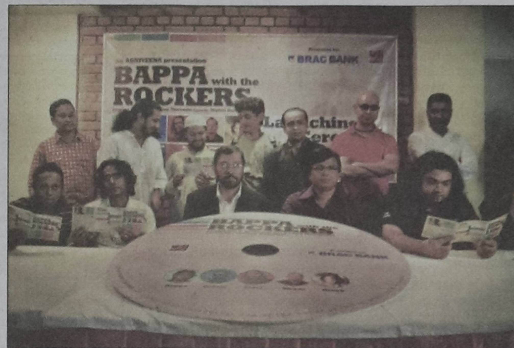
Artistes and guests at the album launch.