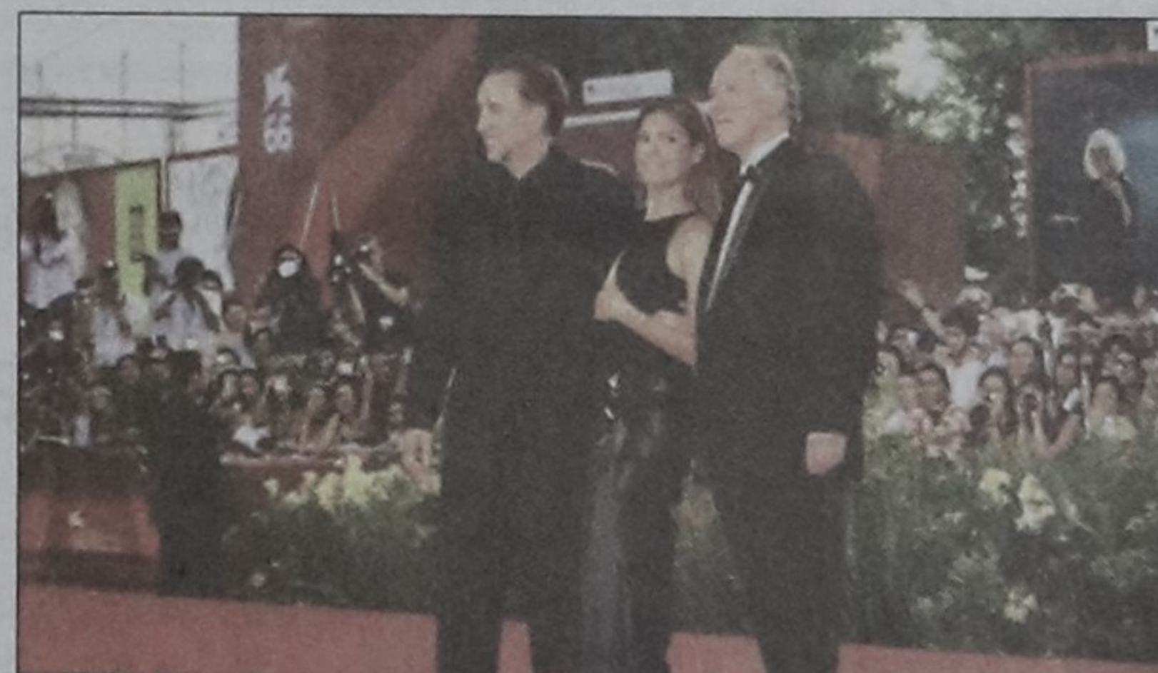
US actors Nicolas Cage and Eva Mendes arrive with German director Werner Herzog for the screening of the film "Bad Lieutenant: Port of Call New Orleans" at the 66th Venice Film Festival on September 4, 2009.

Produced by David Lynch, the film is based on the true story of a southern California actor who kills his mother.