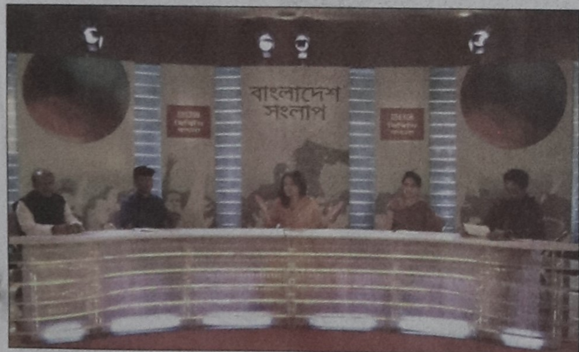
Participants and the moderator of tonight's episode of the programme.