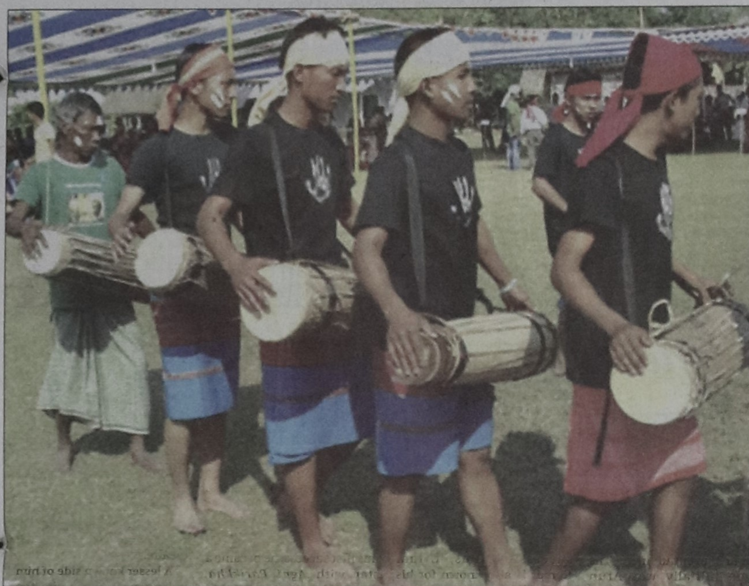
Garos performers with traditional musical instruments at a Wana celebration.