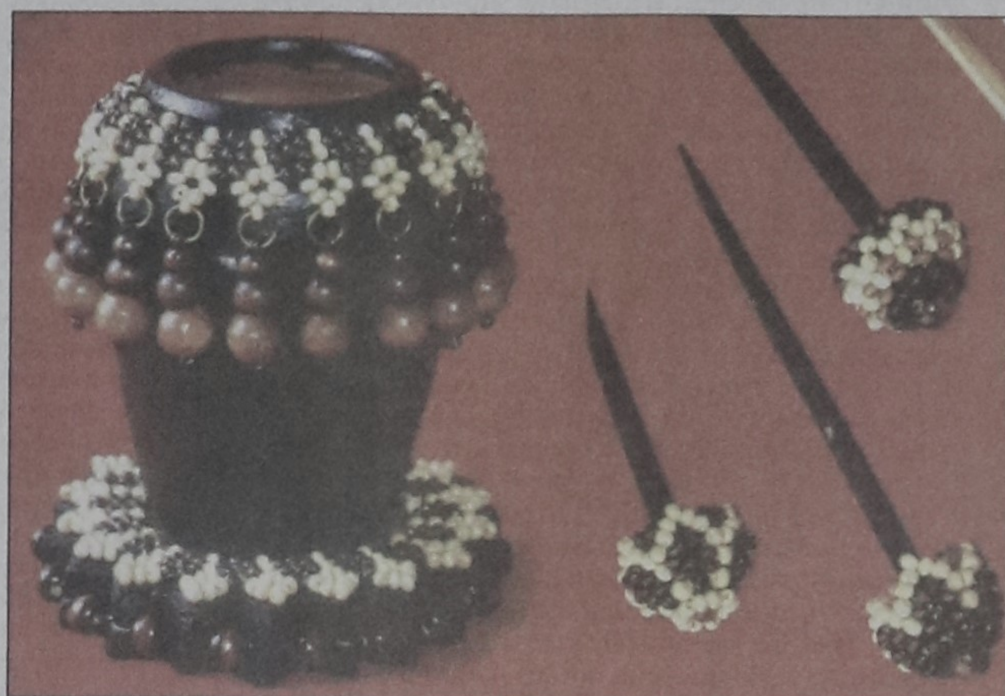
Bead jewellery at the exhibition.