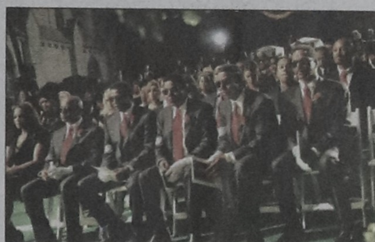
(From left) Janet, Randy, Jackie, Tito, Jermaine and Marlon Jackson attend Michael Jackson's funeral service held at Glendale Forest Lawn Memorial Park on September 3, 2009.

Dr. Conrad Murray, Jackson's personal physician, told detectives he gave the singer a series of sedatives and the powerful anaesthetic propofol to help him sleep. Prosecutors are still investigating, and no charges have been filed.