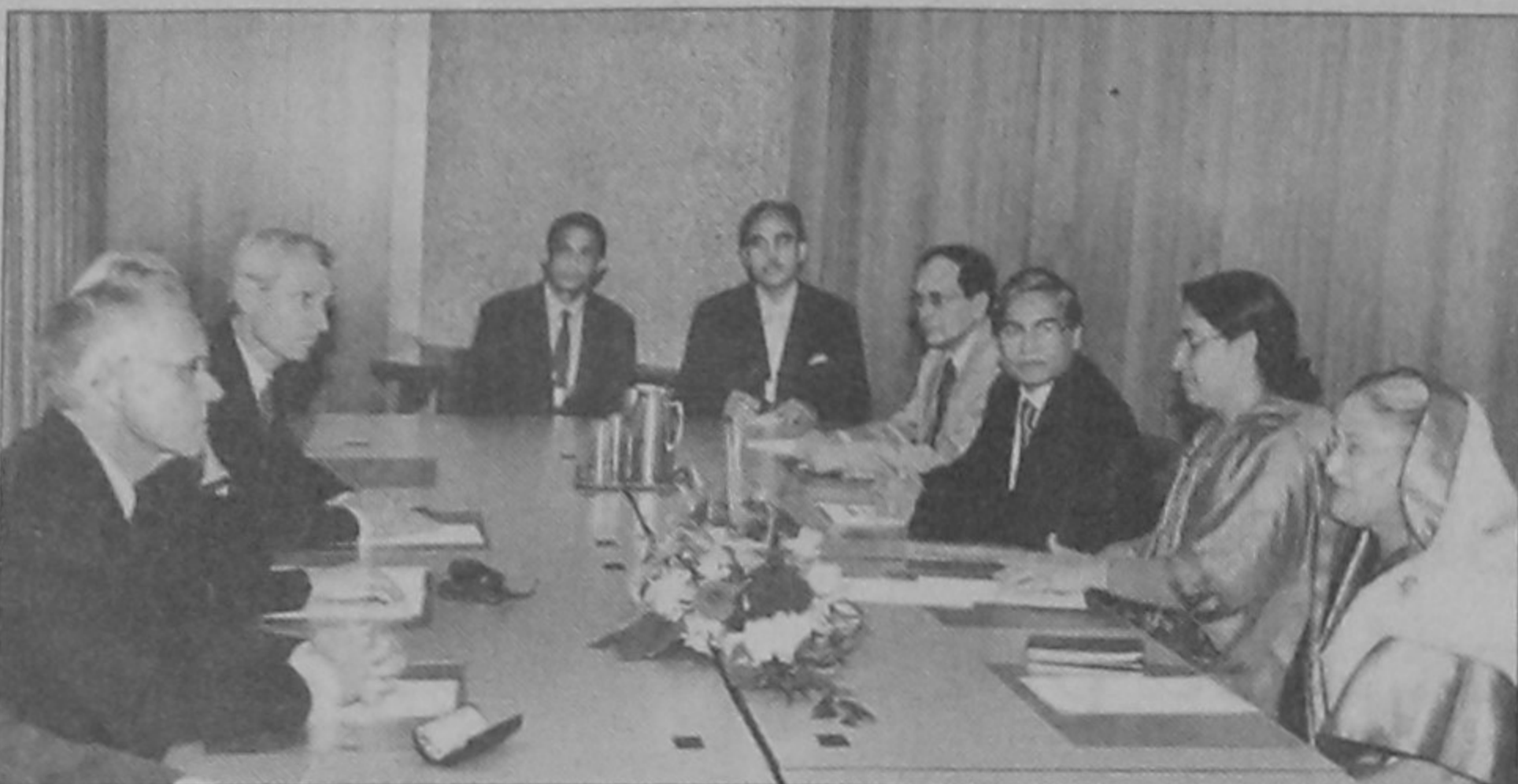
Swiss Environment Minister Moritz Leuenberger meets Prime Minister Sheikh Hasina on the sidelines of the UN-sponsored conference on global climate change in Geneva, Switzerland, on Friday.

A tussle ensued as some of the Hizb-ut men tried to free their fellows after they were caught by the law enforcers.