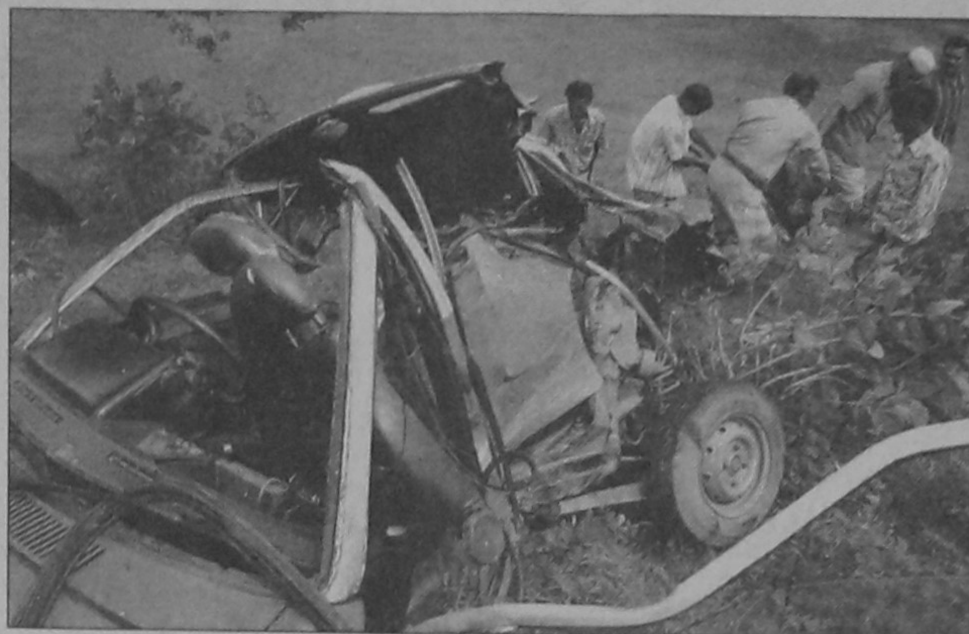
Local people recover the bodies of five members of a family killed in a head-on collision between a truck and a taxicab in front of Birulia Pump House at Pallabi Beribadh in the city yesterday. (Story on Page 16)

Two of the injured succumbed to their injuries at Sylhet MAG Osmani Medical College Hospital.