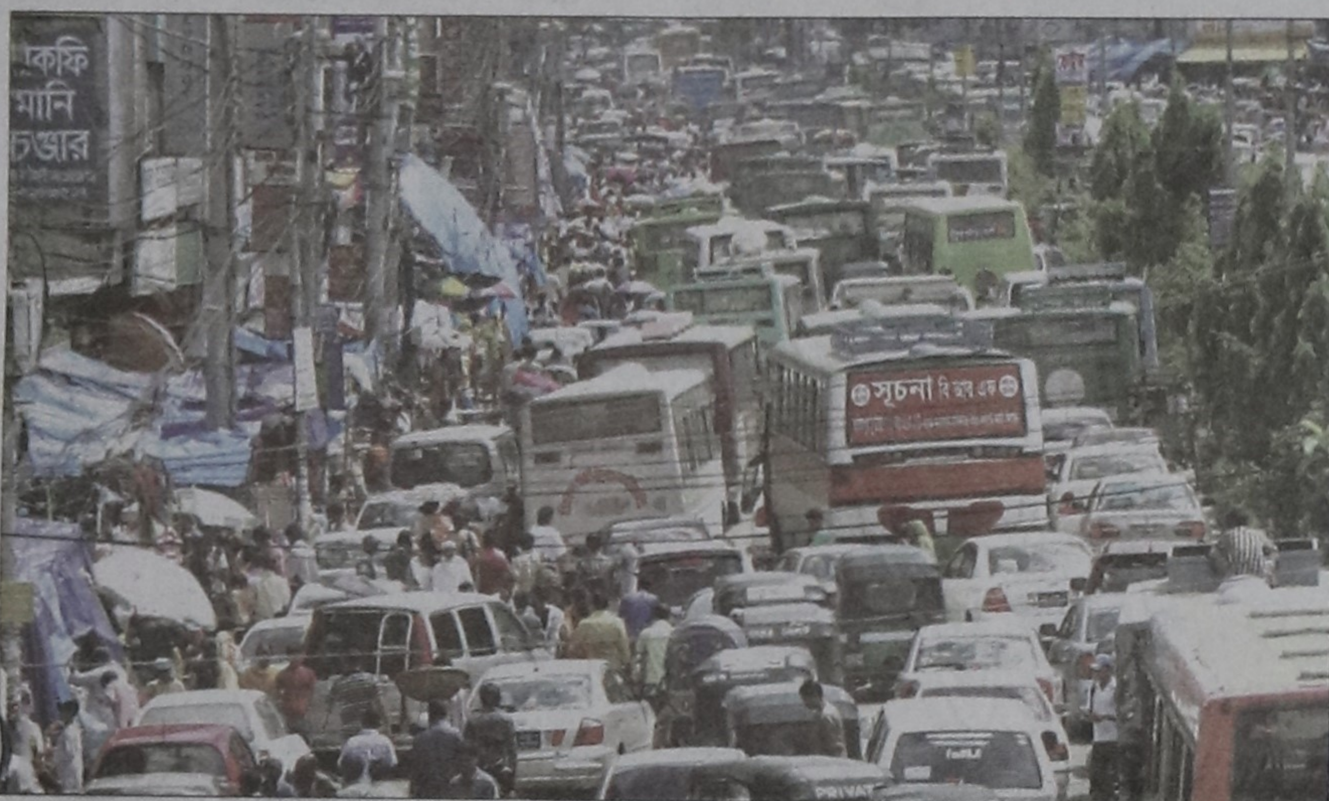
As people throng New Market and Science Lab areas for Eid shopping, hawkers occupy the pavements of Mirpur Road and parked cars narrow the road down triggering nagging traffic jam. The photo was taken yesterday.