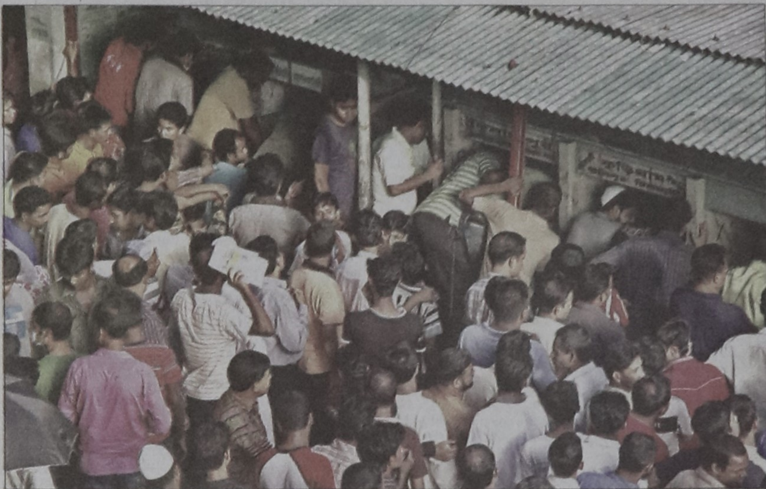
Advance ticket booking for the Eid holidays started from yesterday. Homebound people have been waiting for tickets since sehri in the city's Shyamoli bus station.