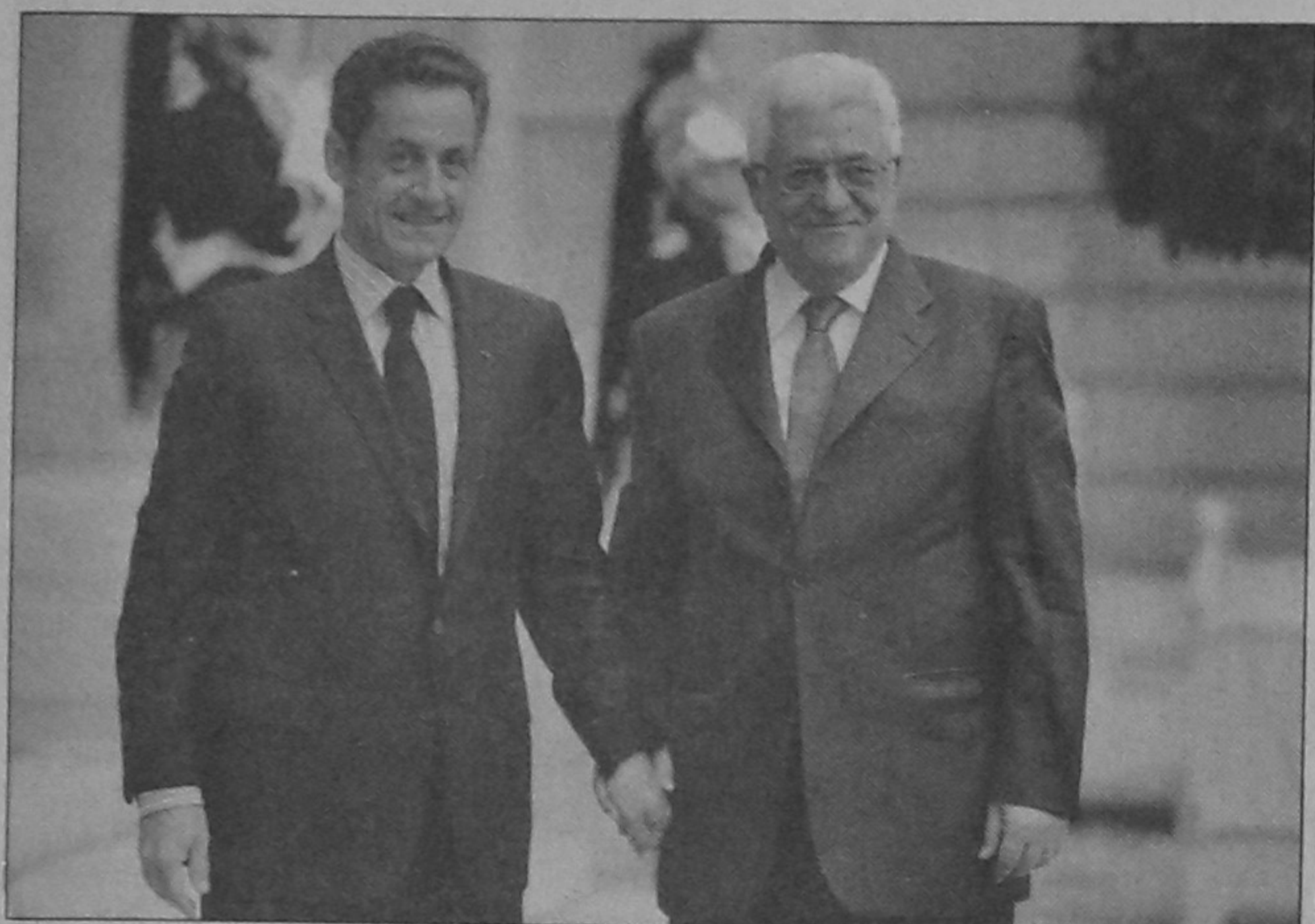
French President Nicolas Sarkozy (L) welcomes Palestinian Authority President Mahmoud Abbas prior to their meeting yesterday at the Elysee Palace in Paris.

The Palestinians have refused to resume peace talks until Israel freezes all construction in the West Bank and east Jerusalem, where they want to make the eastern part of the Holy City the capital of their promised state.