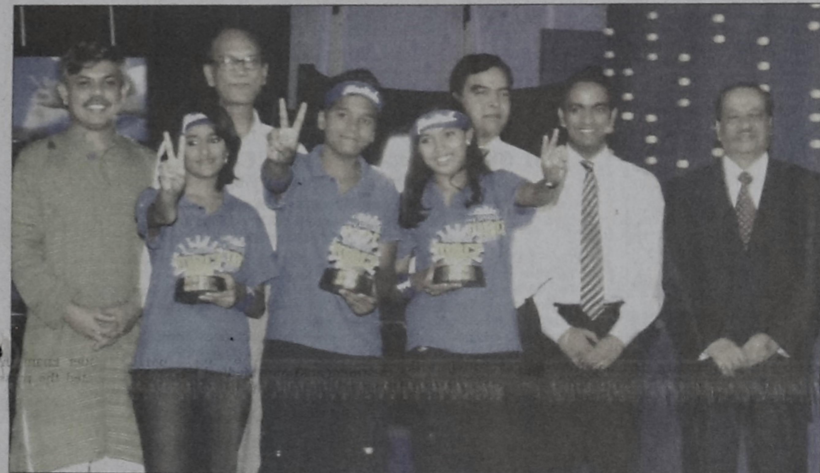
Winners of Horlicks Future Force 2009, a talent hunt programme for the children, pose for photograph with Education Minister Nurul Islam Nahid and other guests at the award giving ceremony at a city hotel yesterday.

The additional IGP inaugurated a Service Delivery Centre at Habiganj Model Police Station.