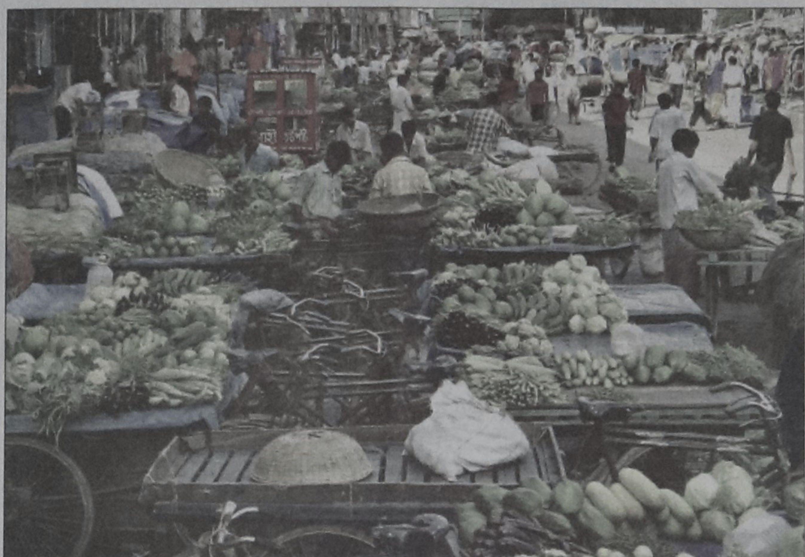
Vendors occupy a portion of Mirpur Mazar Road to sell vegetables every day, causing suffering to road users, but the authorities appear to be indifferent.

The existing remains now are a few medieval buildings, mostly religious, belonging to the Sultanate and Mughal periods, some Mughal bridges, and a few residential buildings of the colonial periods. The other remains are Sultan Ghiyasuddin Azam Shah's tomb at Shah Chalapur, Panch Pir Dargah and a mosque at Bhagalpur, Sonakanda fort, Dewanbagh mosque at Dewanbagh.