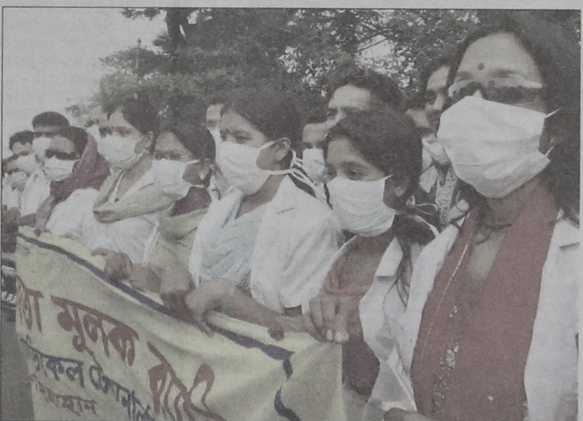
Bangladesh Technical Education Board Medical Technologist Society forms an human chain in front of the National Press Club in the city yesterday to raise awareness about swine flu.