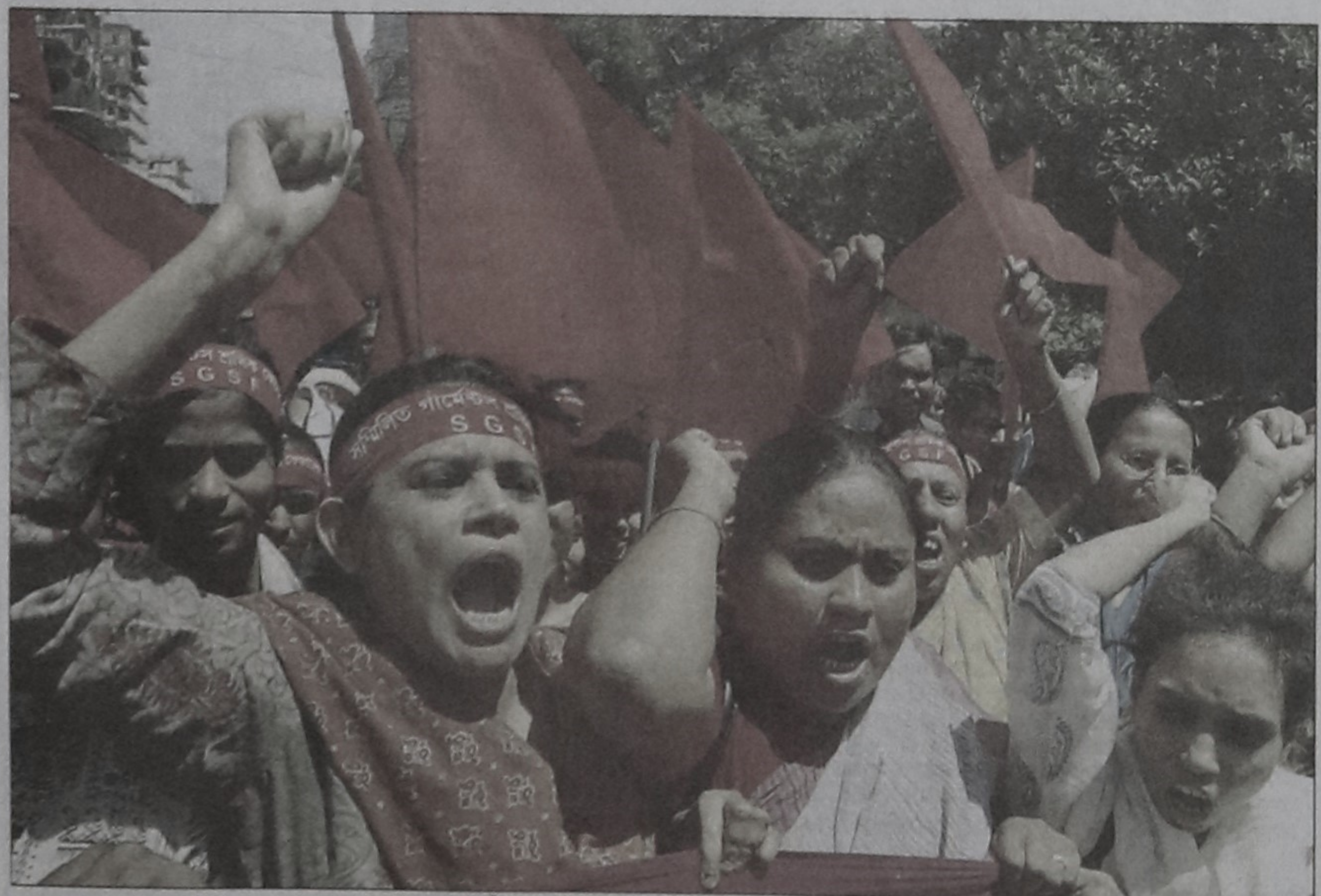
Sammilita Garment Sramik Oikya Parishad takes out a procession at Muktangan in the city yesterday demanding payment of bonus and salary arrears to the garment workers before Eid.

DMP official sources said their intelligence personnel, plain-clothes forces and patrolling teams have already been stationed.