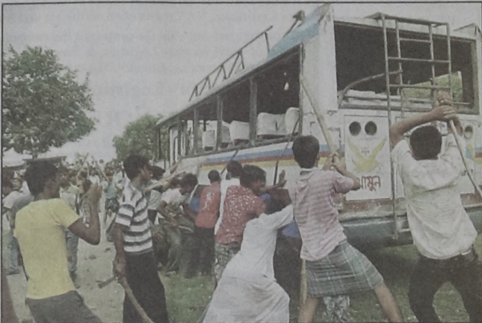
Locals damage a private bus at Charghat yesterday in protest against stoppage of BRTC bus service on Rajshahi-Charghat-Bagha route.