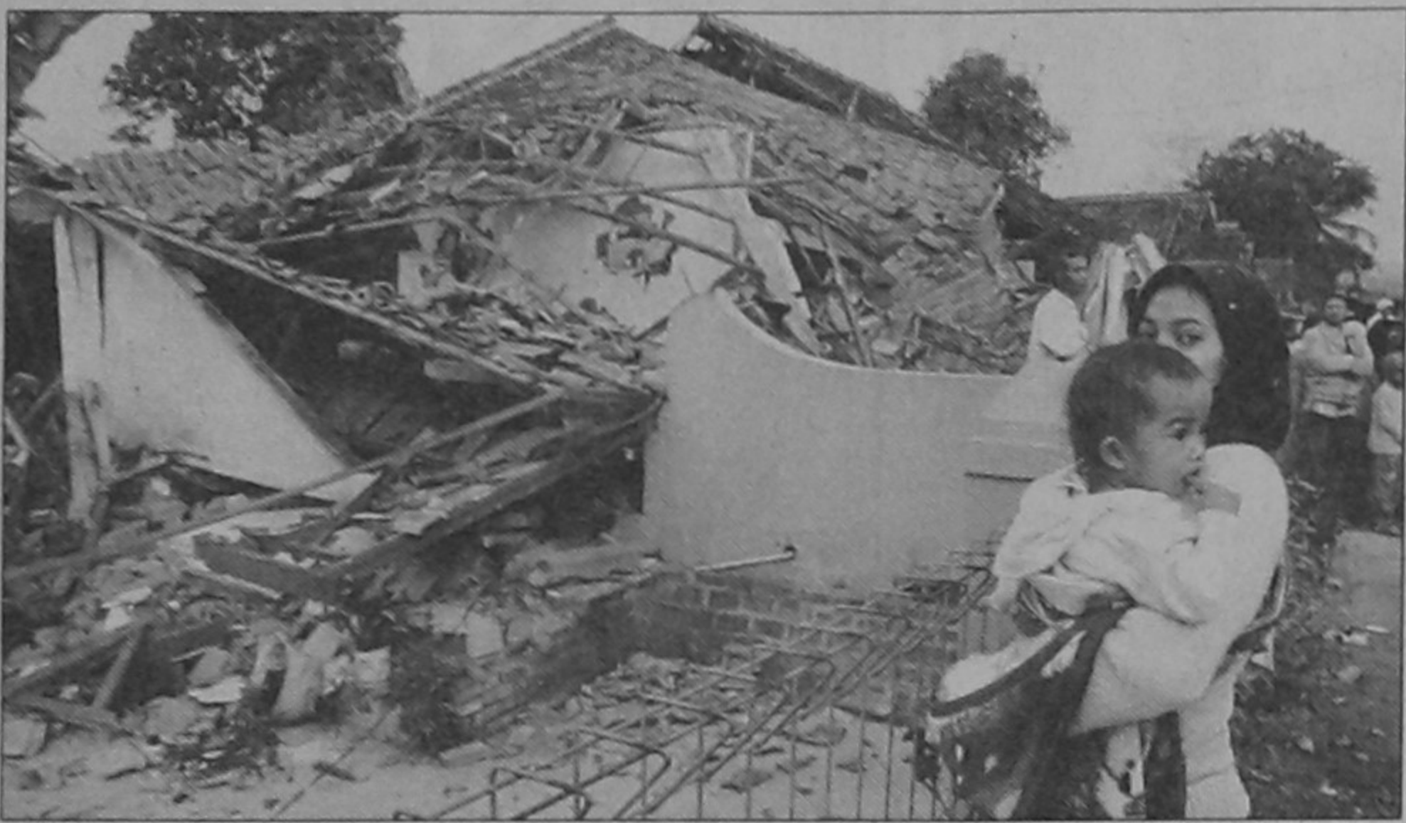
Indonesian residents stand beside a collapsed house following an earthquake in Tasikmalaya town in West Java yesterday. Rescue workers on Indonesia's Java island searched by hand for dozens of people trapped by a major 7.0-magnitude earthquake that killed at least 57, officials said.