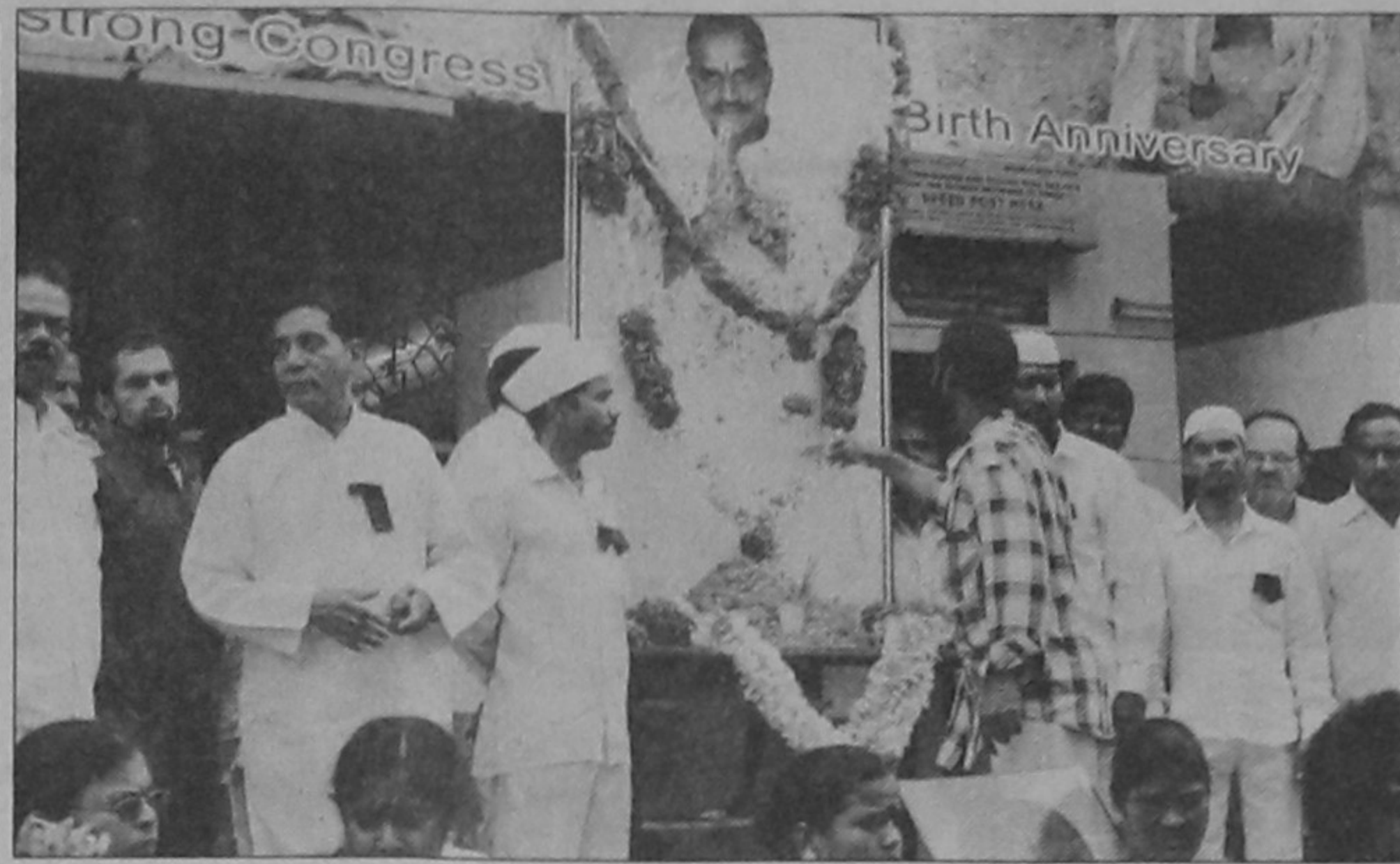
Indian Congress party workers place flowers by a portrait of deceased Andhra Pradesh Chief Minister YS Rajasekar Reddy at Gandhi Bhavan in Hyderabad yesterday. Reddy and four others went missing after leaving Hyderabad at 8.30 am on Wednesday in a helicopter later found in the south-eastern state's dense mountain forest with its dead passengers.

"Saudi Arab ought not to be involved in the politics of Pakistan and I have no idea as to why Musharraf visited the kingdom," Sharif said.