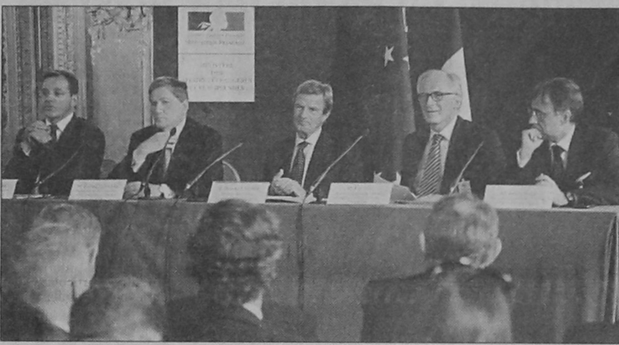
(From left) International special envoys for Afghanistan and Pakistan, French Thierry Mariani, US Richard Holbrooke, France's Foreign Affairs Minister Bernard Kouchner, UN secretary general's special envoy, Norwegian Kai Eide, and European Union special envoy Ettore Sequi, attend a press conference after their meeting on Wednesday in Paris.

Washington's relations with Karzai have grown strained while public opinion in the US and Europe has cooled over what is seen as an ill-defined Afghan campaign bogged down in violence.