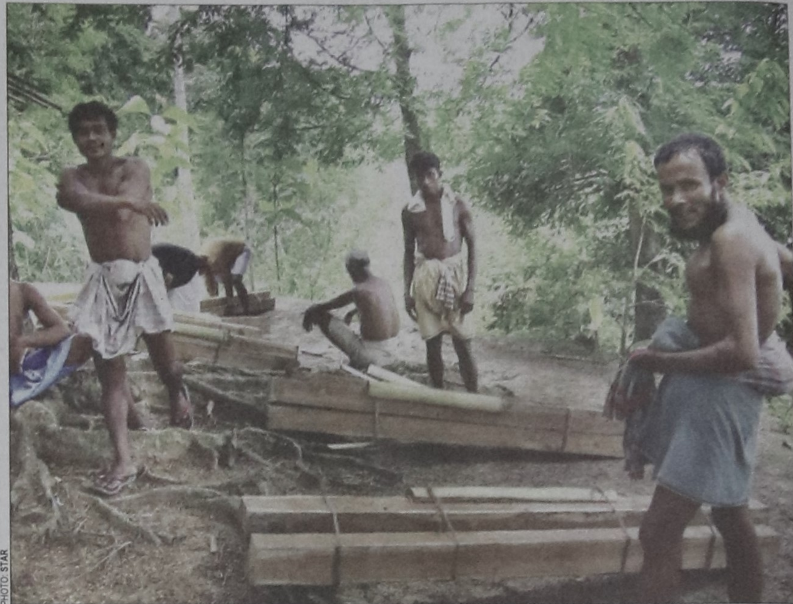
Illegal loggers at reserve forest in Farua, Rangamati are seen ready to shift stolen timber to market.