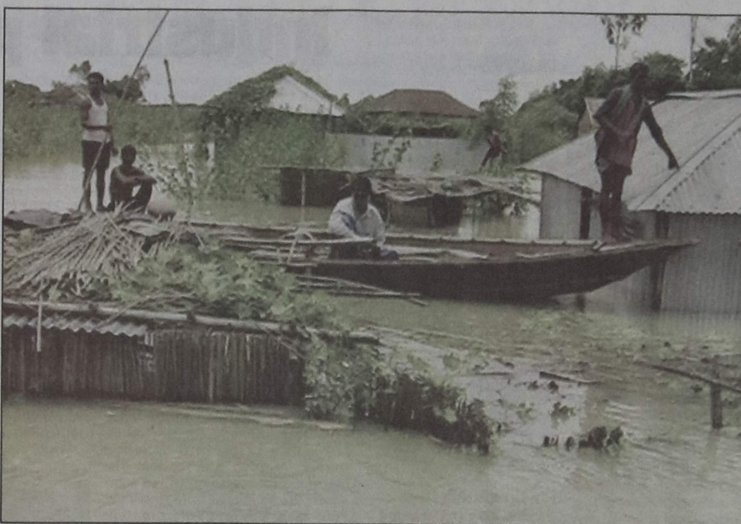
People living in char areas of Bhupur upazila under Tangail district still remain marooned though the flood situation has improved in other affected upazilas of the district.