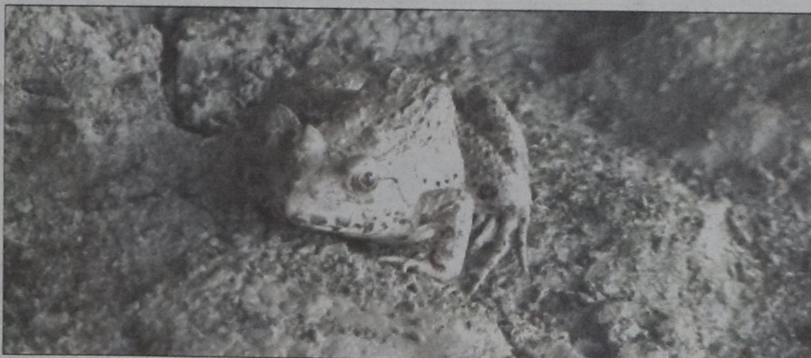
This photo shows the rare crab-eating frog spotted in Nalian Bazar in the Sundarbans.