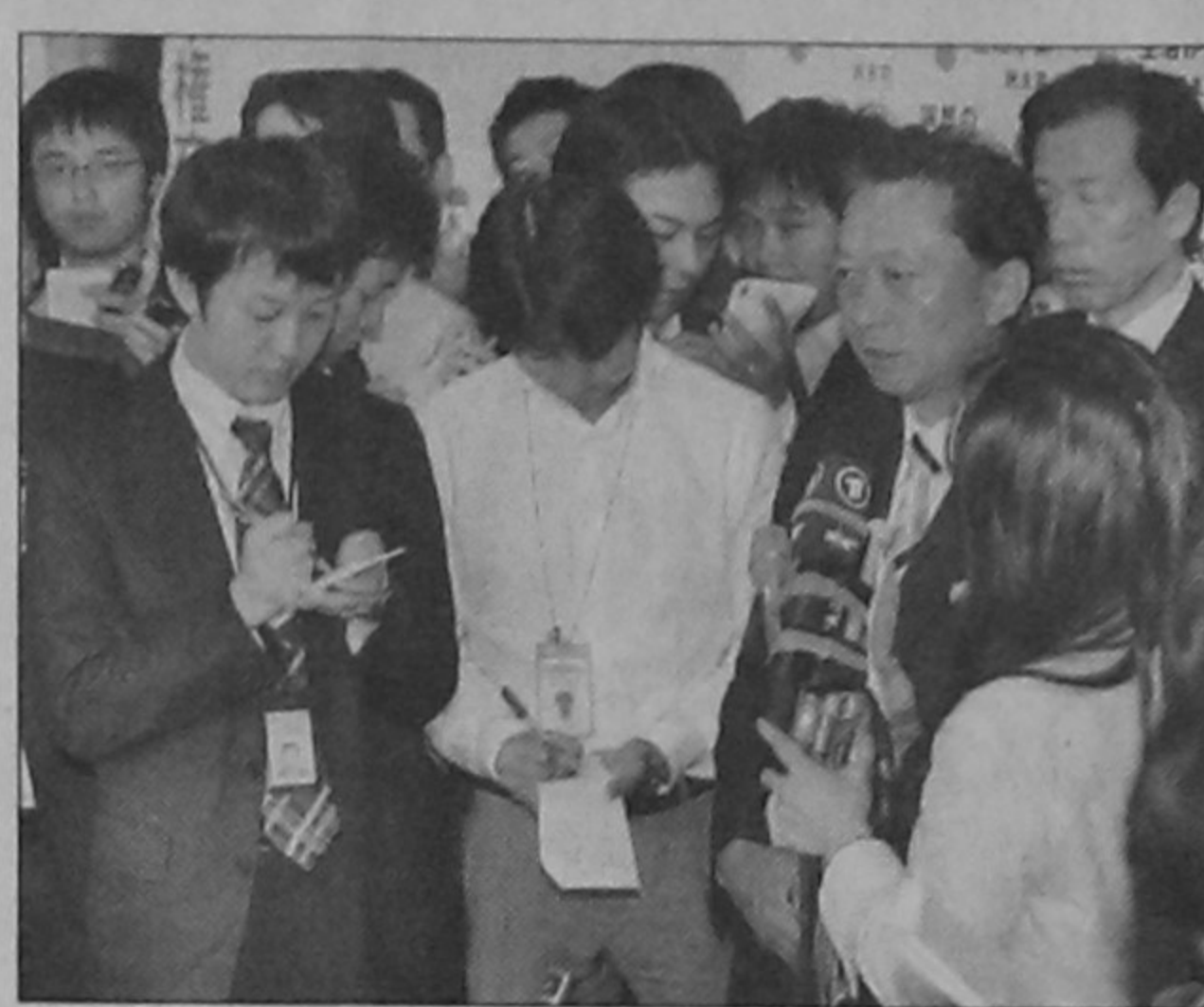
Democratic Party of Japan leader Yukio Hatoyama (3rd R) attends a press conference at the party headquarters in Tokyo yesterday.