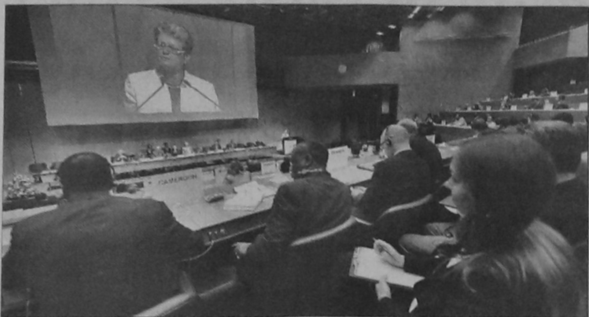
Participants listen as Special Envoy on Climate Change for the United Nations Secretary-General and former prime minister of Norway Gro Harlem Brundtland (on screen) delivers a speech on the opening day of the third international conference on the climate organised by the World Meteorological Organisation yesterday in Geneva.