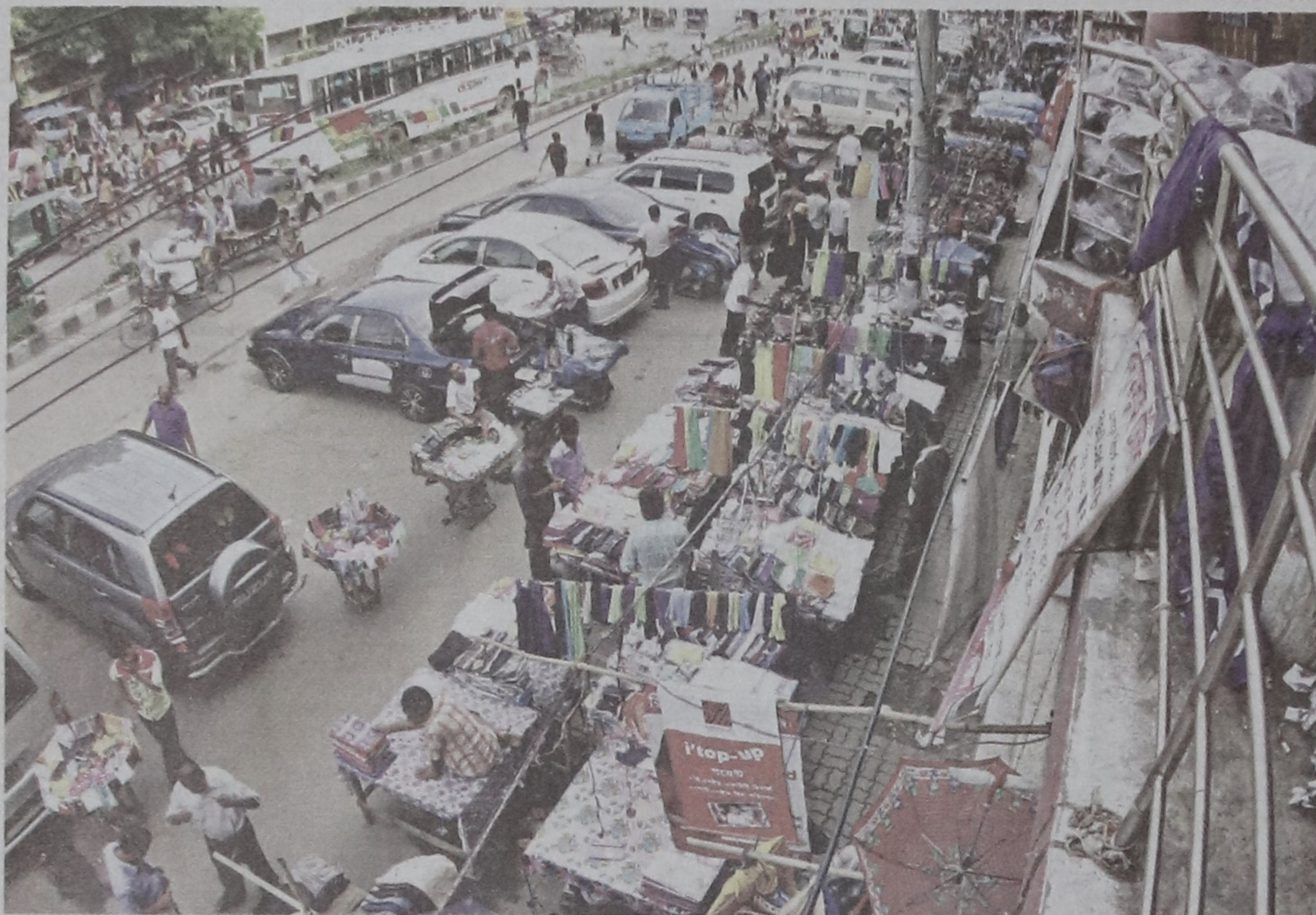
Illegally parked vehicles occupy half of the road which contributes to severe traffic gridlock, while hawkers continue using the footpath in Gulistan in the capital yesterday.