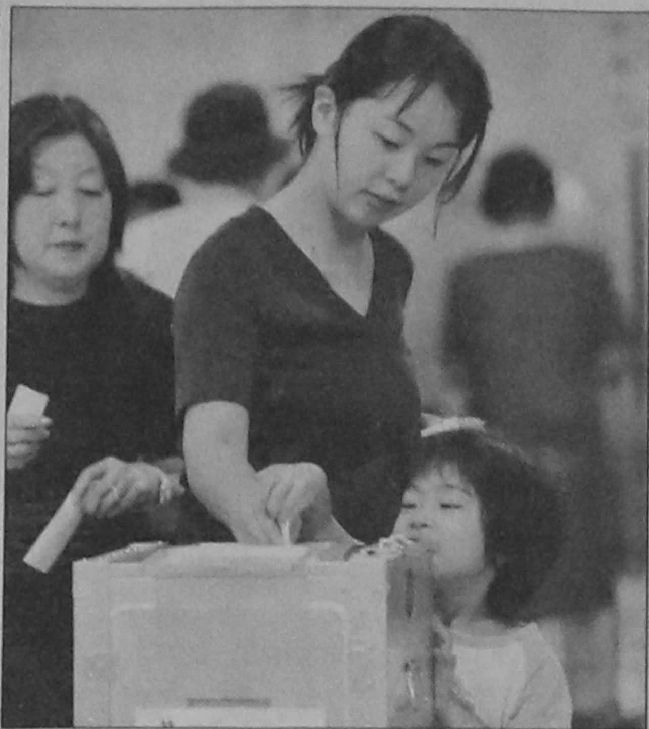
A little girl (R) helps to cast a vote for her mother in Japan's general elections at a polling station in Tokyo yesterday.

A railway employee was killed and ten people injured when armed robbers looted cash and valuables from passengers of a local train in Bihar's Jamui district, police said yesterday.