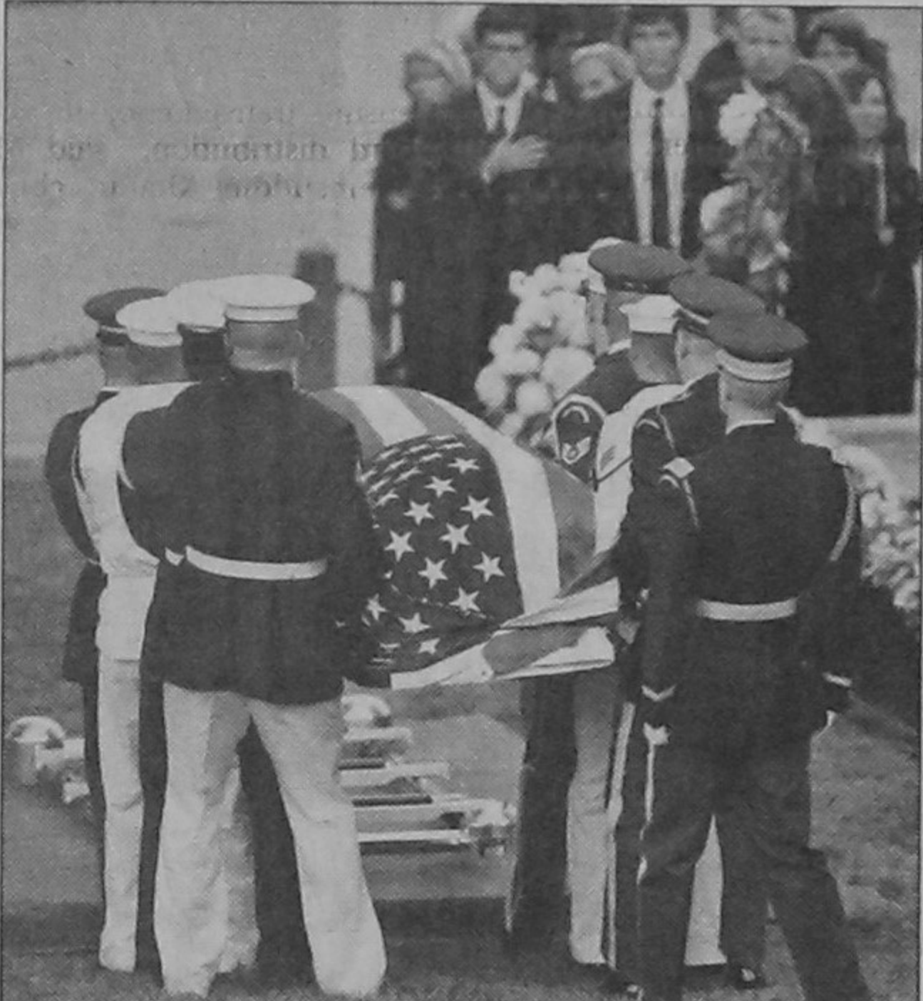
Members of an honour guard carry the casket in near darkness during the burial of US Senator Edward Kennedy as family and friends attend the service on Saturday at Arlington National Cemetery. Kennedy, the youngest brother of former US president John F Kennedy, died after a long battle with brain cancer on Aug 25.