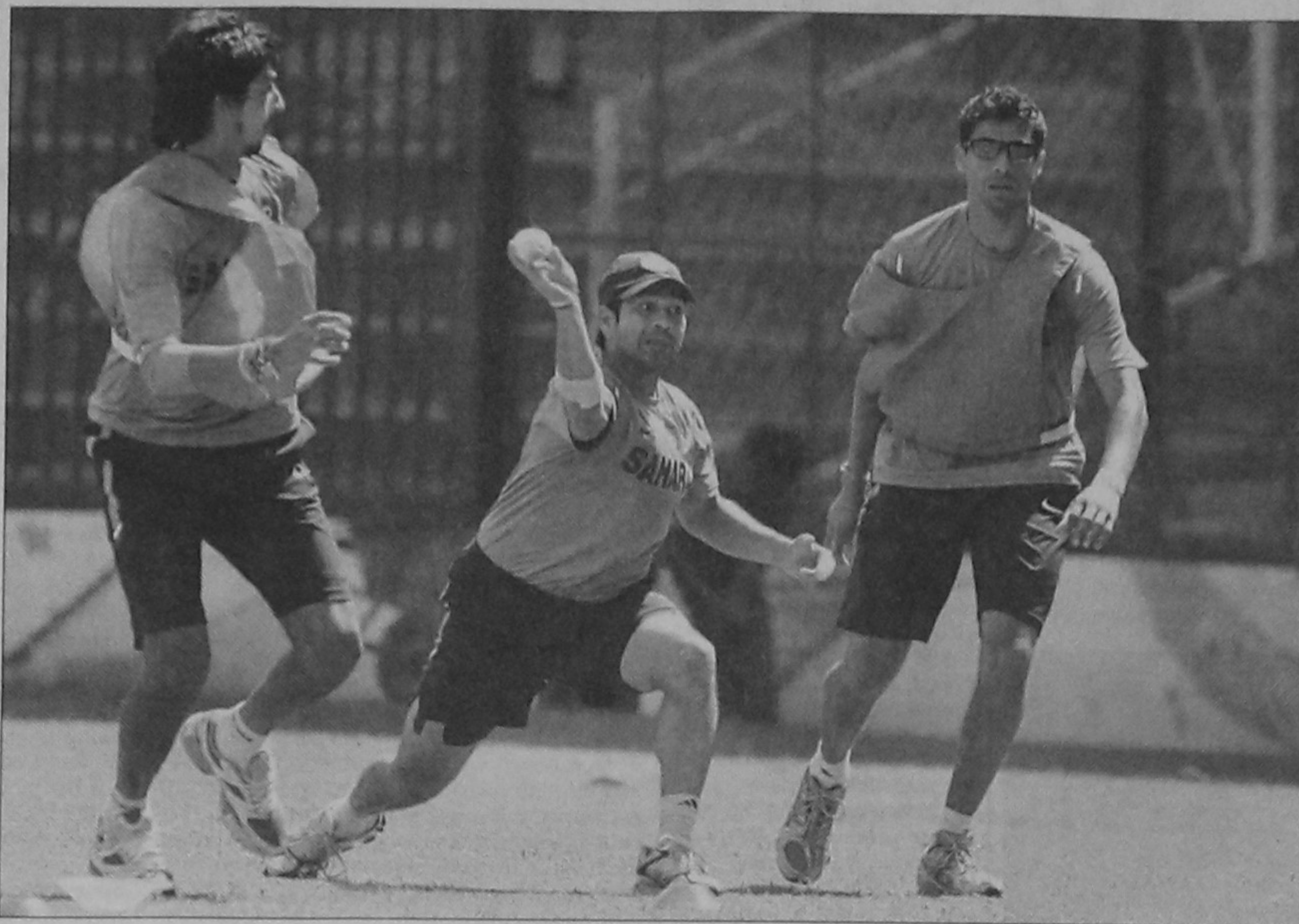
Sachin Tendulkar (C) is closely watched by teammates Ashish Nehra (R) and Ishant Sharma as he throws during a practice session at the M Chinnaswamy Stadium in Bangalore on Friday. Fifteen cricketers of the national side are attending the camp in the southern Indian city.

A Portuguese artist has made a life-size sculpture of Jose Mourinho's famous Armani coat.