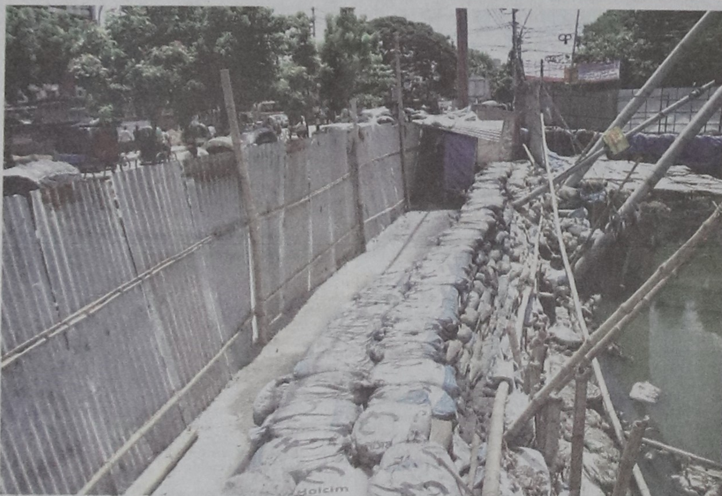
A building is being built occupying the pavement and more at Shahjahanpur in the capital, just across the street from Rajarbagh Police Lines.