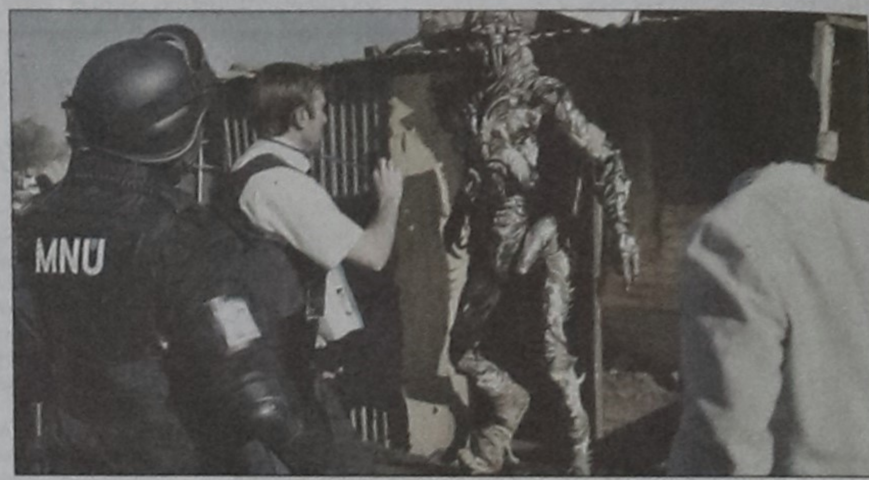
In "District 9", an alien spacecraft stalls over Johannesburg.

Blomkamp described his hometown as "this amazing, racially charged, powder-keg city -- an urban prison."