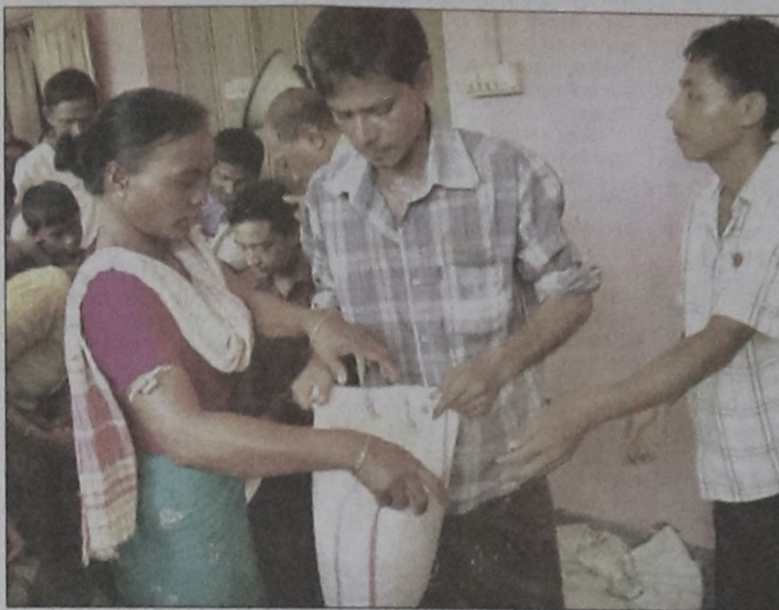
A woman, left, receives rice at Khagrachhari Municipality Bhaban with her VGF card and the same woman is seen in the picture on the right where she is selling the rice to a shop just 100 feet away from the Bhaban as she does not need it.