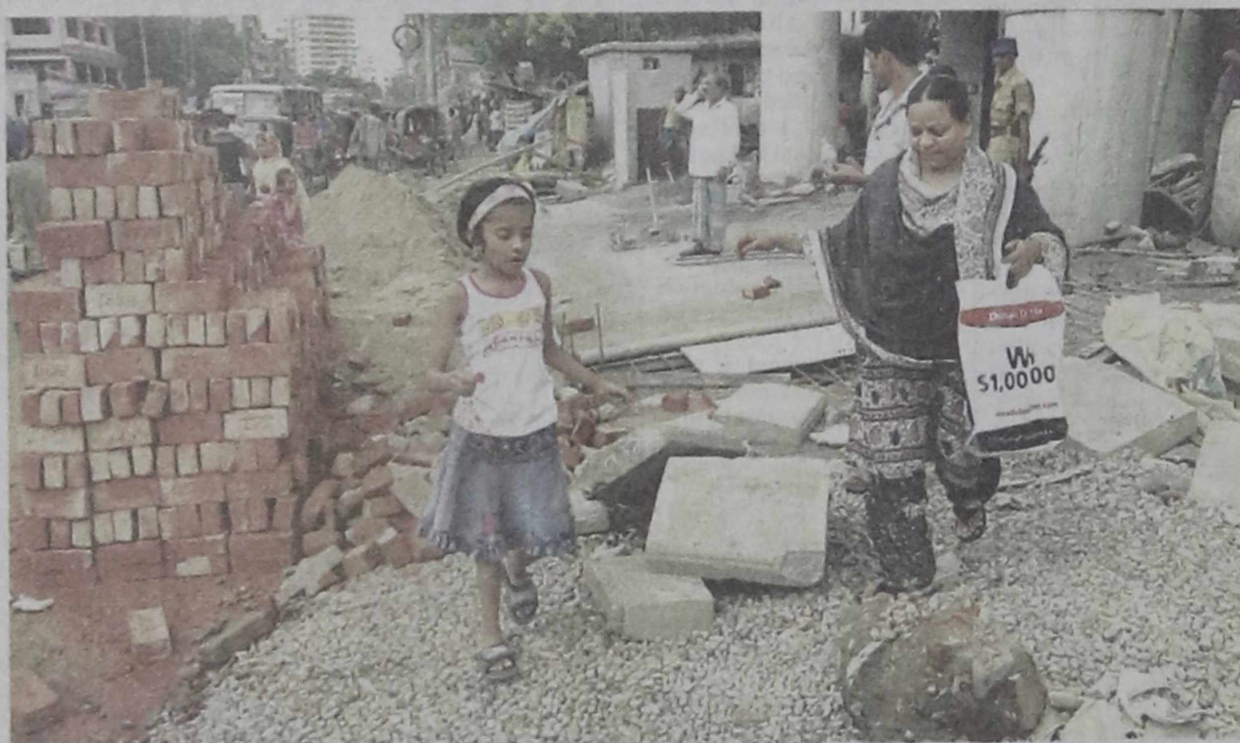
Mother and child make their way over the construction material a developer of Siraj Tower left on the pavement of Shaheed Selina Parveen Road near Mouchak Market.