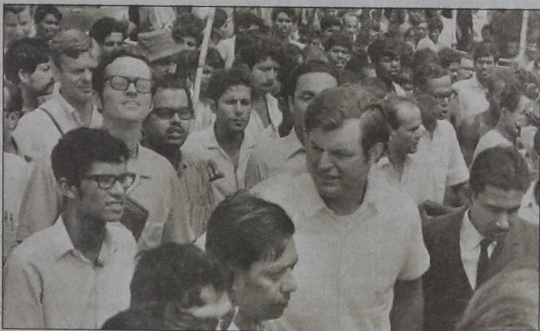
This 1971 file photo shows the then US Senator Edward Kennedy visiting refugee camps in Kolkata, India. Over one crore Bangladeshis took refuge in India during the Liberation War.