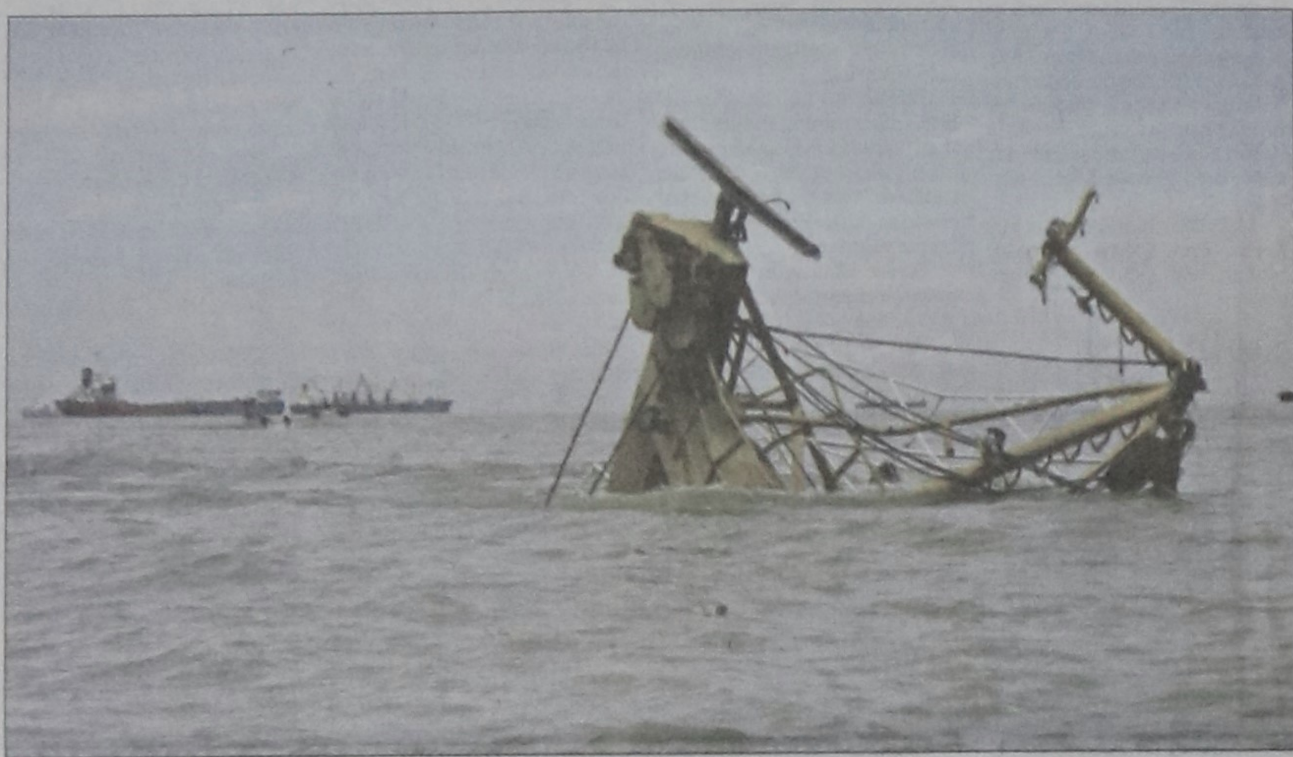
The ship BLV of Chittagong Port sank at the port channel Monday night. Movement of ships through this channel has become risky following consecutive accidents at the same spot.