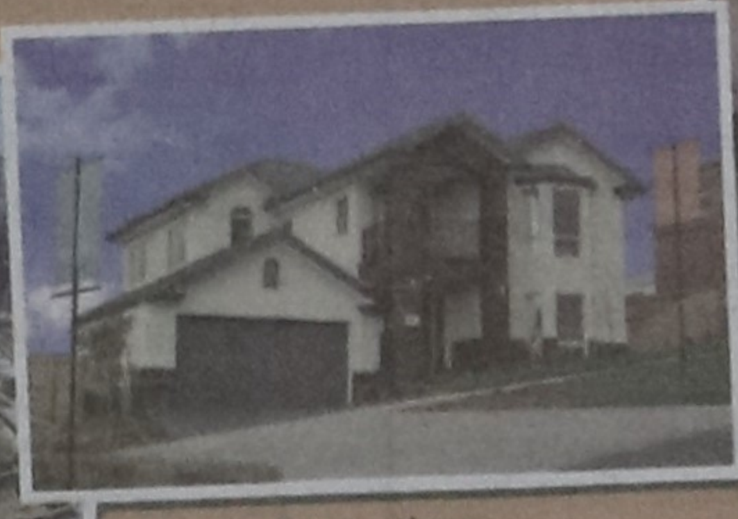
Architecturally designed homes