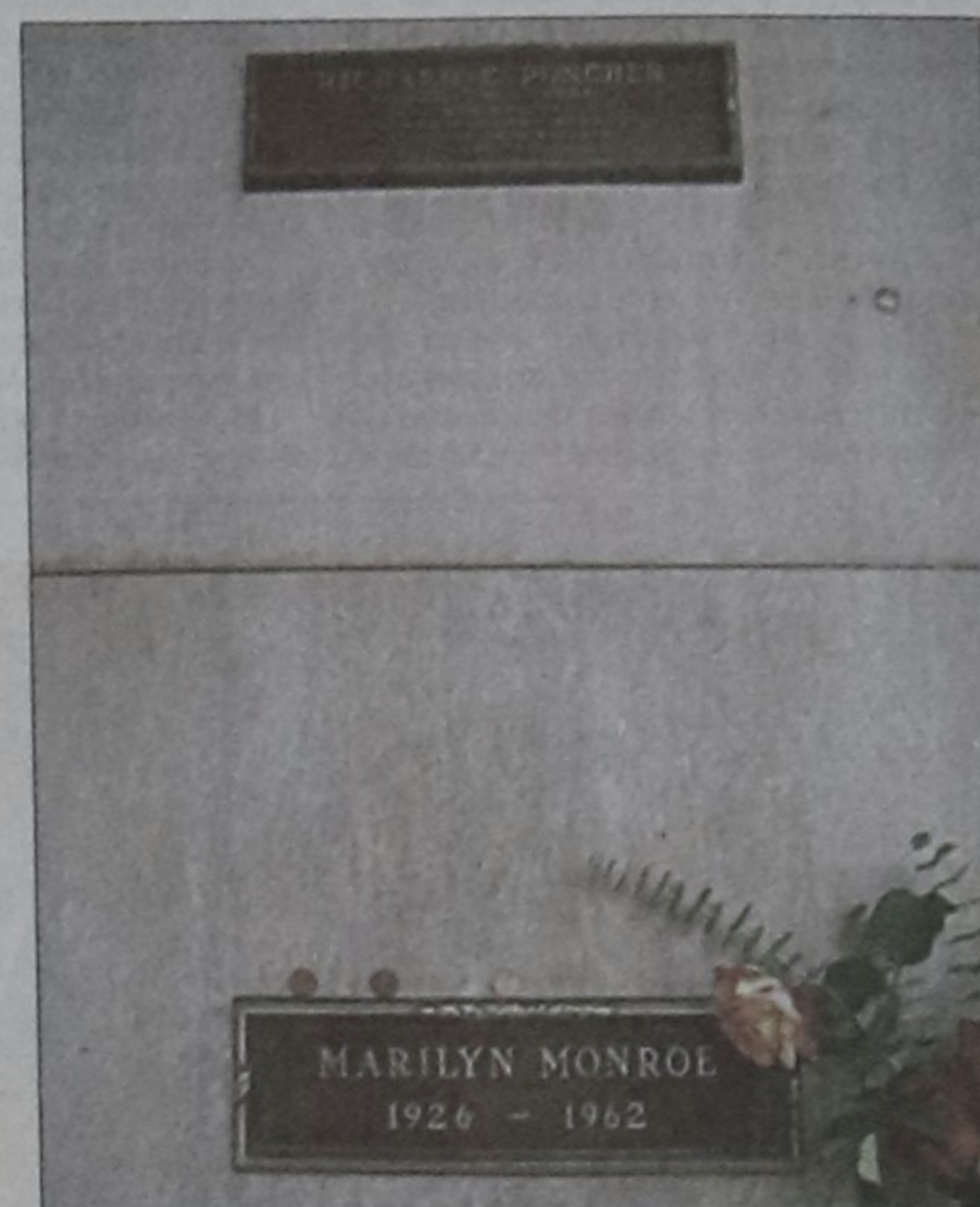
Marilyn Monroe's crypt lies in the Corridor of Memories Mausoleum at Westwood Village Memorial Park in Los Angeles.

planned to be buried on top of Monroe's grave, until their made-in-Hollywood romance turned sour.