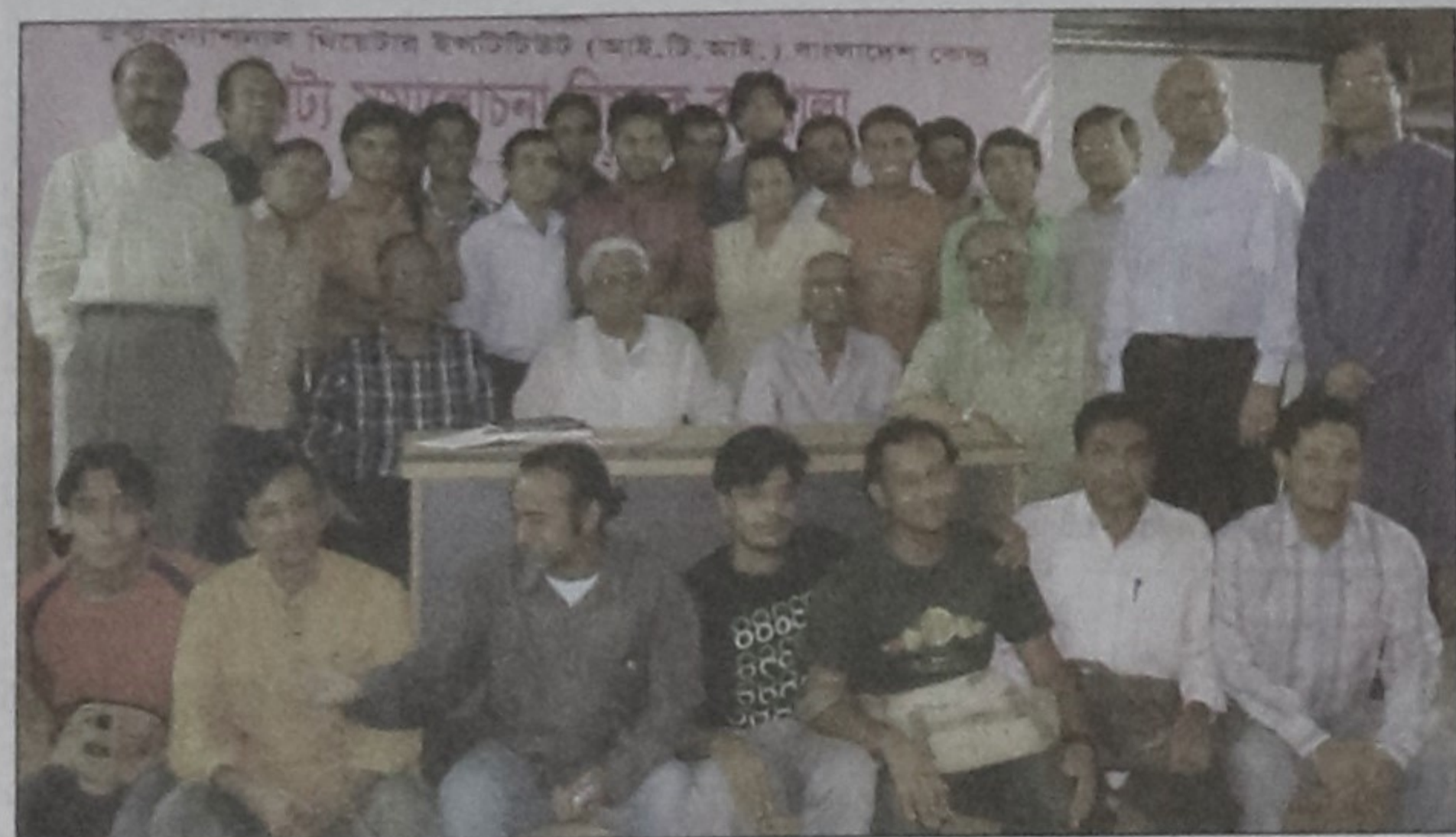
Participants of the workshop with distinguished personalities.

A five-day workshop on theatre criticism was held at Bangladesh Shilpakala Academy (BSA). Jointly arranged by International Theatre Institute (ITI) and BSA, the workshop ended on August 24, says a press release.