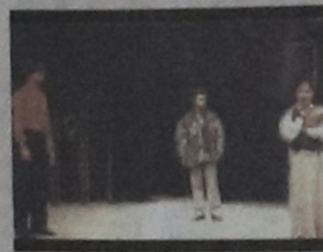
Photo Workshop and Exhibition

Play: The Freedom of the City Troupe: Uddichi Central Drama Section Venue: Mahila Samiti Auditorium, Natok Sharani Date: August 28 Time: 8pm